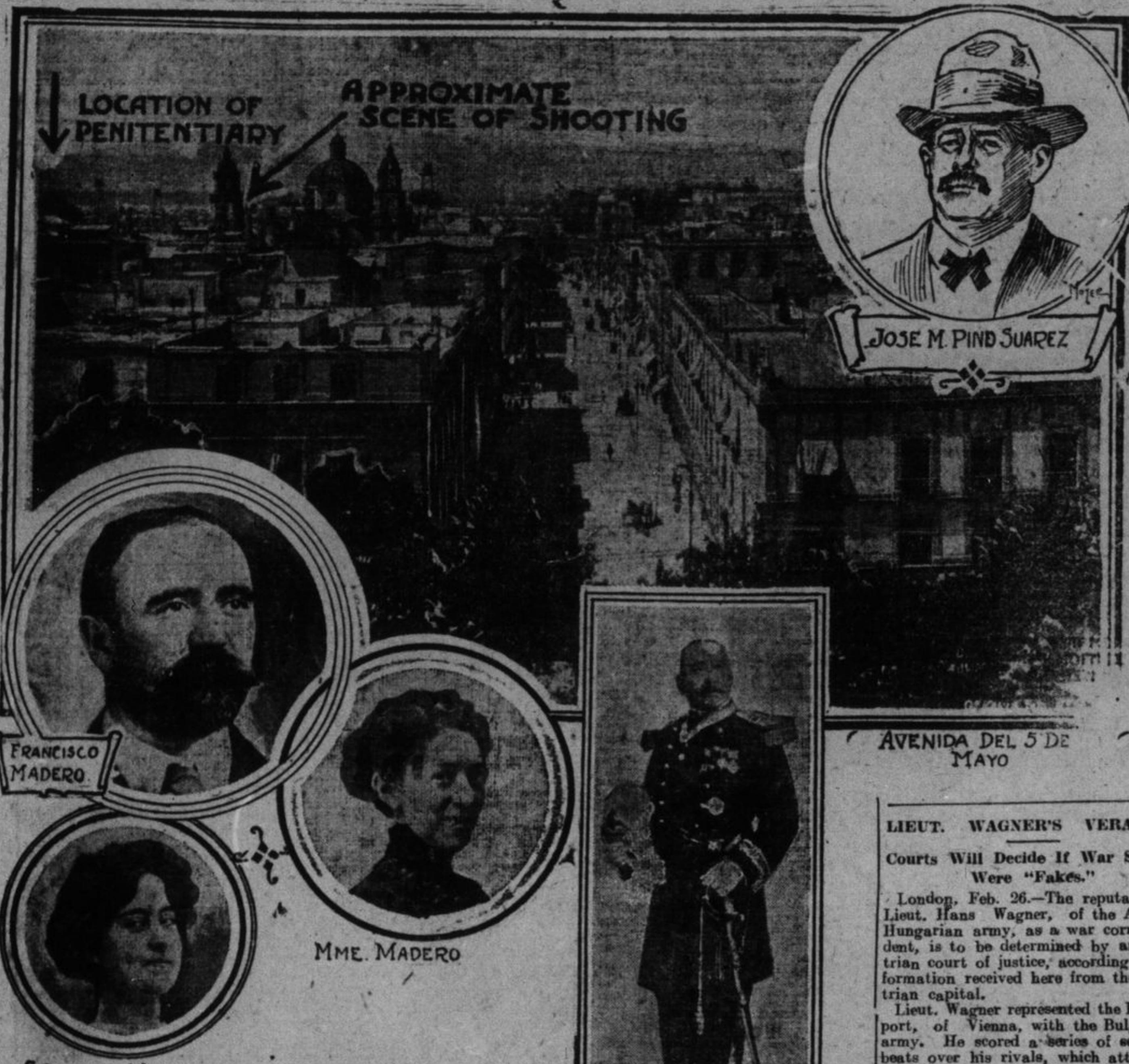
JOSE M. PINO SUAREZ