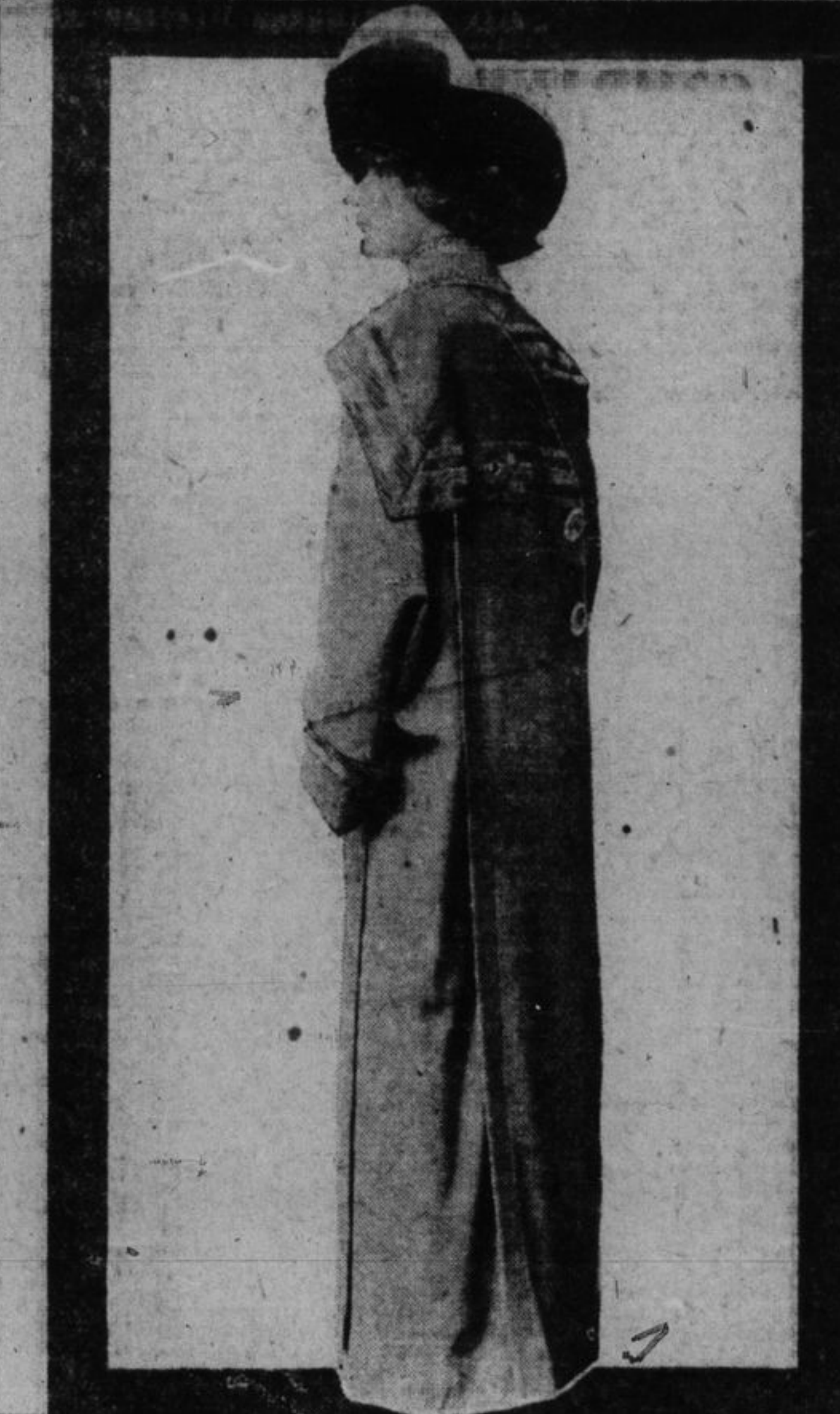
TWO SHADES OF VIOLET IN THIS SOUTHLAND COAT.

Never made is occasionally what he ought to be perpetually in Johnson. The man who is busy never gets lonesome. He's a poor physician who doesn't treat his wife well. Don't expect your ship to come in when the tide is out.