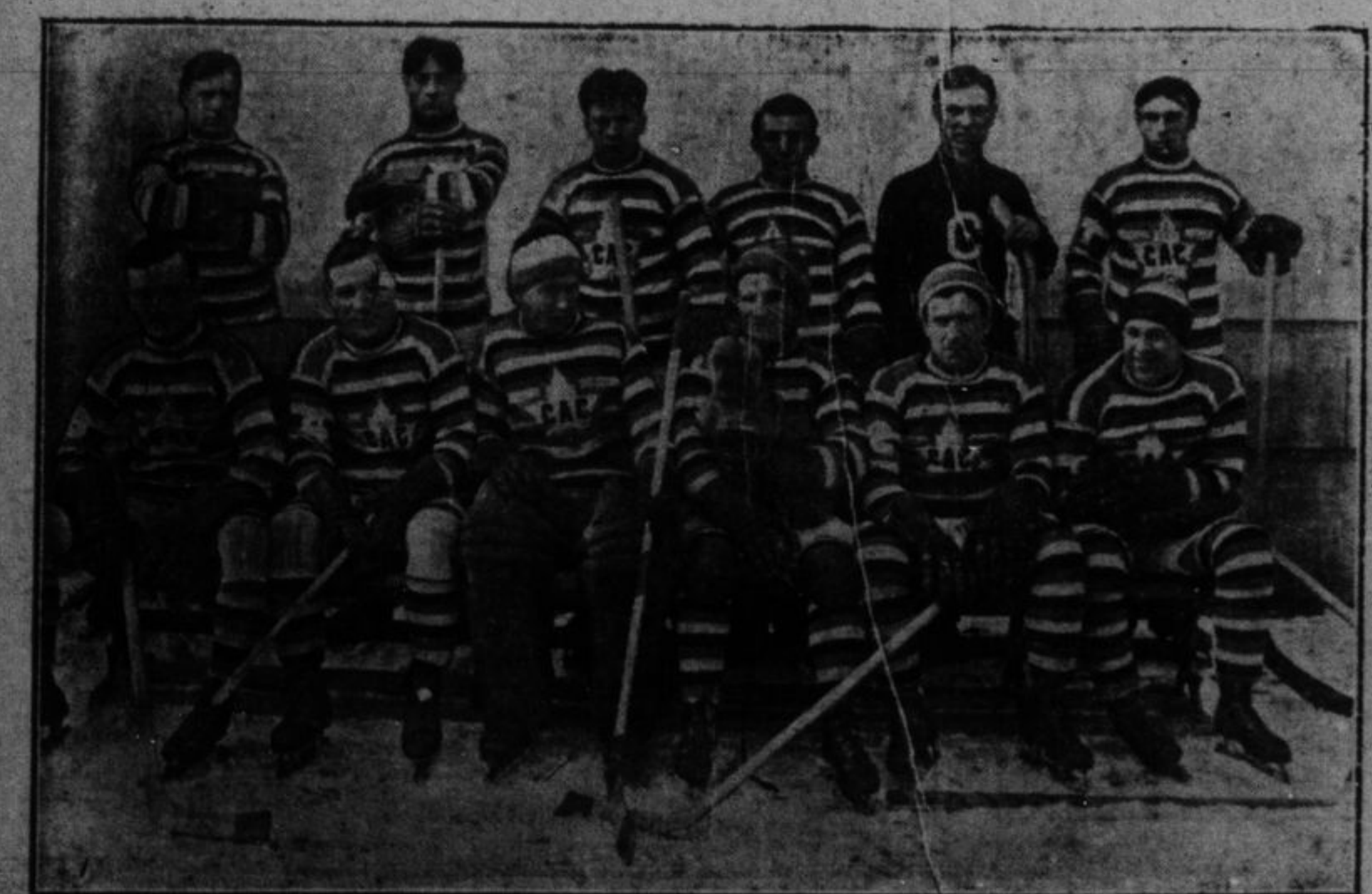
THE FAMOUS CANADIENS OF MONTREAL. A professional hockey team which will likely be heard of this season in the championship hockey classes.