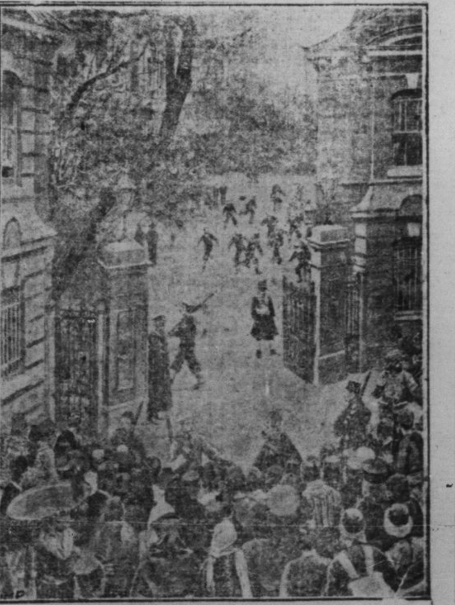
TURKS ADMIRING THE BRITISH TARS. Bluejackets at the British embassy in Constantinople getting some much-needed exercise, while at home in the gardens of the British embassy at Constantinople. The jolly Jack Tars are not a bit enamored with the prospects of spending Christmas Day in a "bloomin' yashen town," but are trying to make the best of it with a good game of British football. They have an admiring gallery of Turks and Greeks to see them at it.