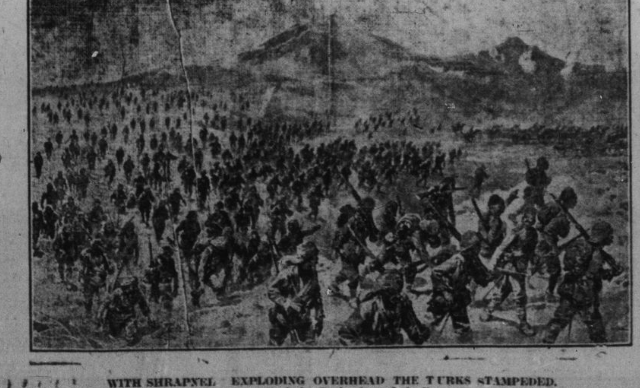
WITH SHRAPNEL EXPLODING OVERHEAD THE TURKS STAMPEDED. The retreat of the Turks from Lake Burgaz.