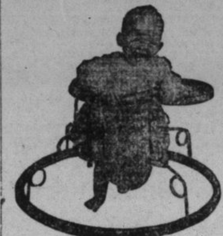
CHILDREN'S TOY SETS.