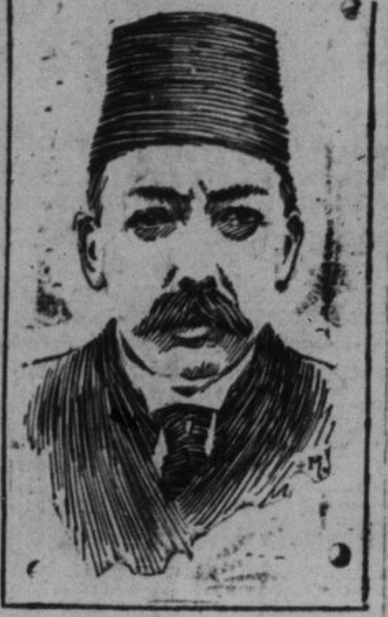
BULLDOG OF TURKEY.

Turkey is moving two armies to the front, one to Macedonia and the other to Adrianople.