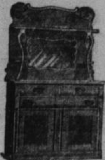
Sideboard, Buffets, China Cabinets, etc. A great line of new designs.

Carpets on the floor, Curtains to the windows, Furniture that's restful and beautiful.