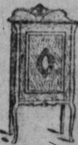
Parlor Cabinets and Parlor Suites. A great range. See our solid Mahogany, ranging from $600 to $1500.