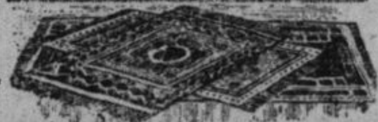
CARPET SQUARES AND MATS AT