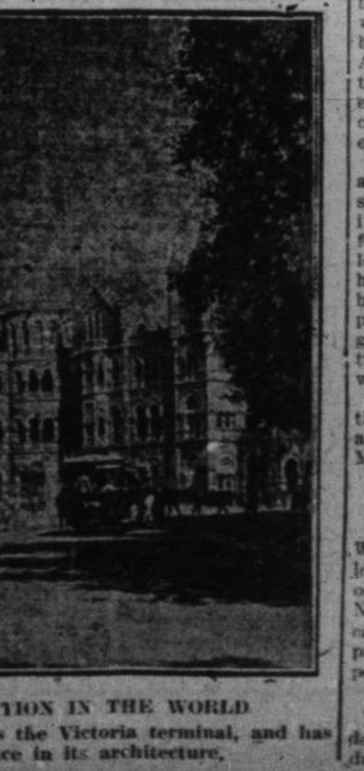
THE GRANDEST RAILWAY STATION IN THE WORLD. Just completed at Bombay, India. It is the Victoria terminal, and has all the grandeur of an Oriental palace in its architecture.