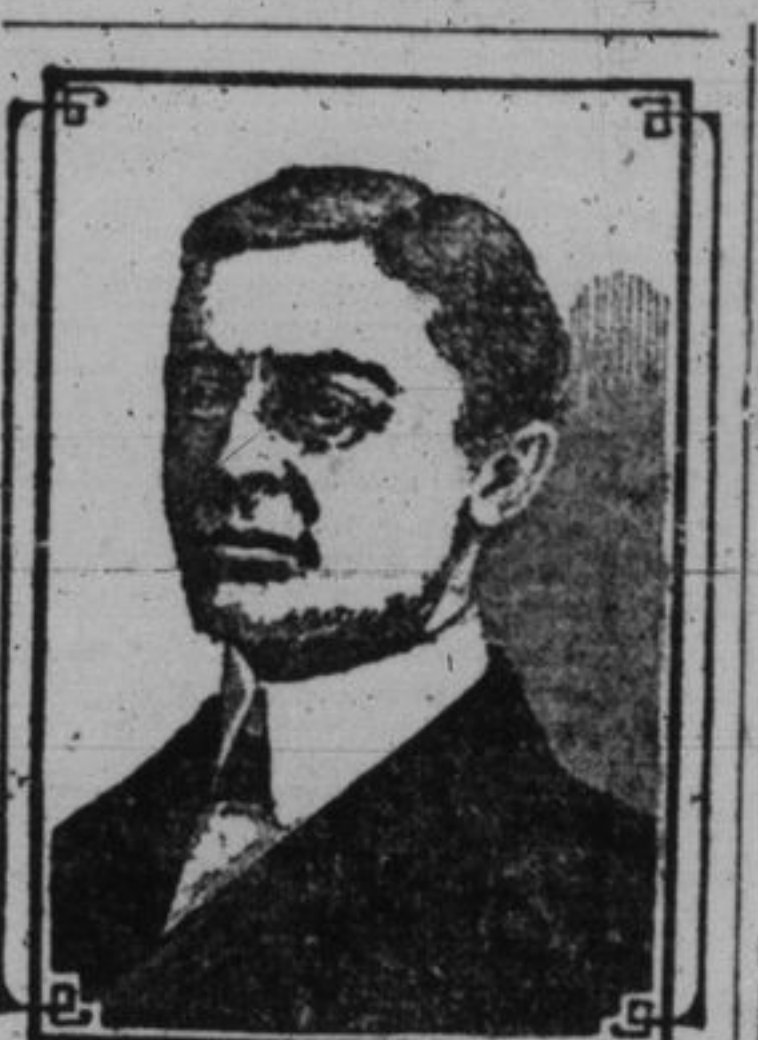
JAMES W. WADSWORTH, JR., former speaker of the New York assembly, has announced his candidacy for the gubernatorial nomination on the republican ticket this fall.