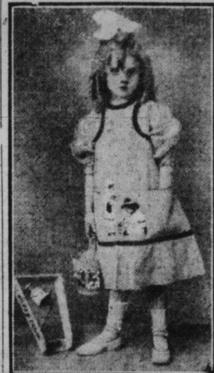
This Holland Pinafore Completely Covers a Dainty Frock.