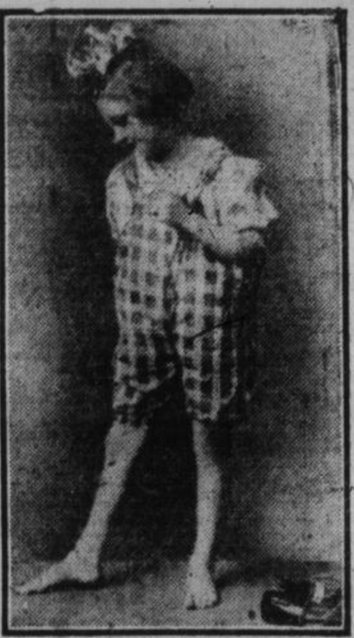
Wading Rombers of Rubberized Silk