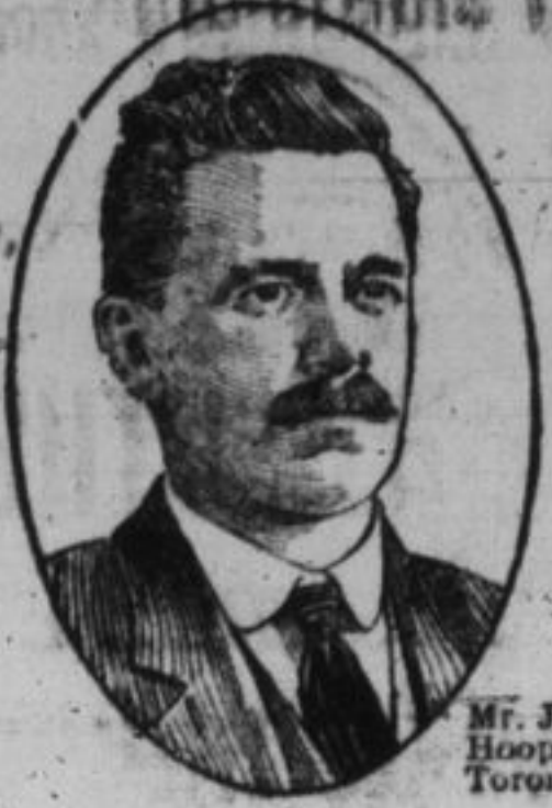
By Cuticura Soap and Cuticura Ointment

"I just want to say a good word for Cuticura Soap and Ointment. Four or five years ago I was in Port Arthur, and I had an attack of the itch. It certainly was an intolerable nuisance. The itching was principally at nights before I went to bed. The bites were especially annoying.