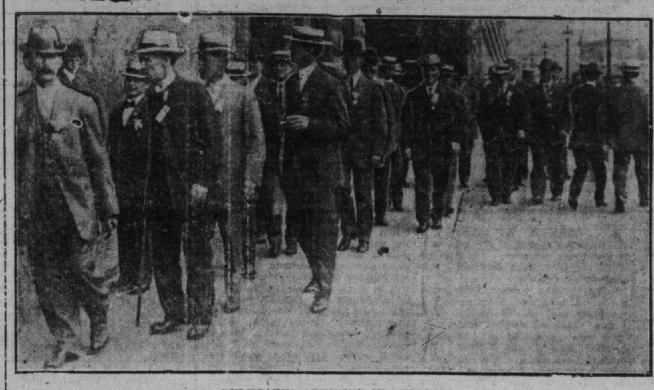
DELEGATES ARRIVING IN CHICAGO. Republican convention representatives from faraway states arriving at the great pavilion where the battle between the Taft and Roosevelt factions is taking place.