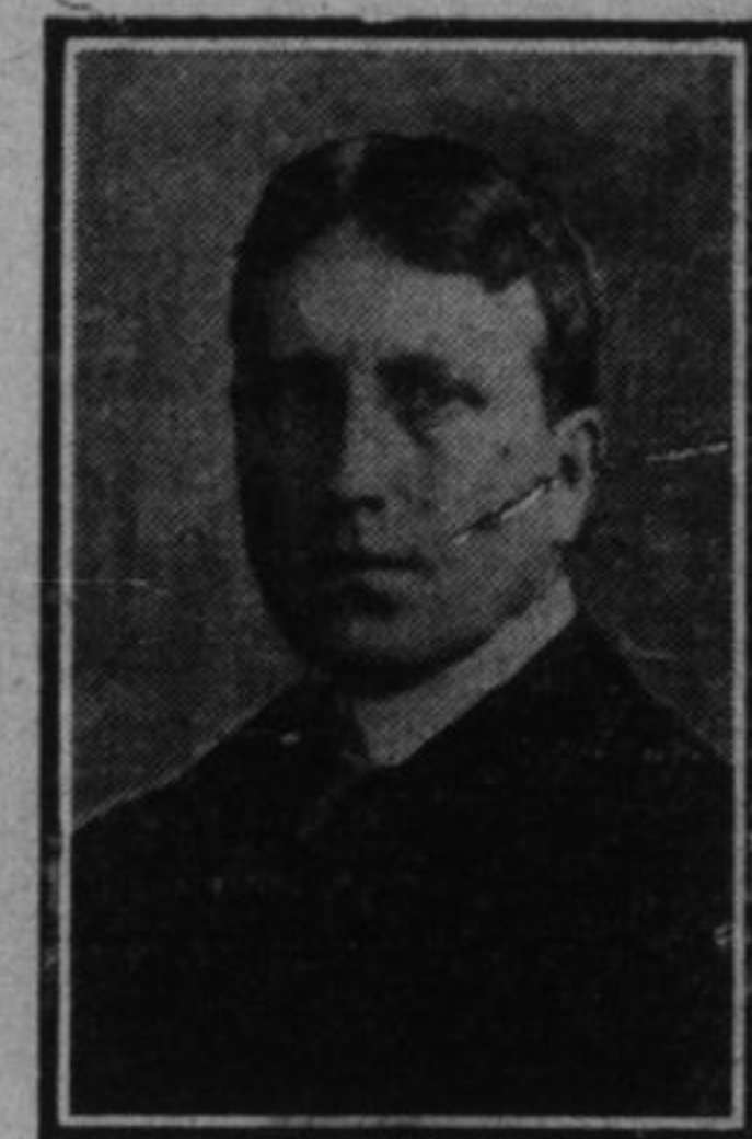
WILLIAM R. HEARST Who may be the U.S. presidential democratic candidate.

Captain and Crew Escaped in the Boats. VESSEL WENT DOWN