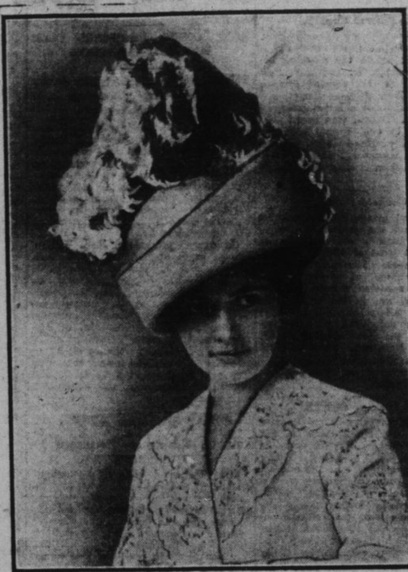
A SPRING HAT TRIMMED WITH FEATHERS. The arrangement of ostrich plumes on this spring hat of gray rib is exceedingly ladylike and pleasing. The hat itself is unexcaggerated in shape and sets well on the head. The plumes are handsome ones in faded gray and cerise tones and are arranged at the back of the hat with the full tips tumbling forward on the crown. This hat accompanied a Palm Beach afternoon costume of white embroidered pique with white buckskin buttoned boots, a cerise parasol and white silk gloves embroidered with small cerise medallions on the wrists.

Gananoque, April 8.—W. B. Carroll, K.C., town solicitor, received instructions during the past week to close negotiations at once for the purchase of the Boyd property, corner of King and Stone streets, for the new post office site. This will mean that operations will be started at an early date. The building, it is understood, will be similar to the new office at Oshawa. A new armory is also among the list of improvements for the town this season.