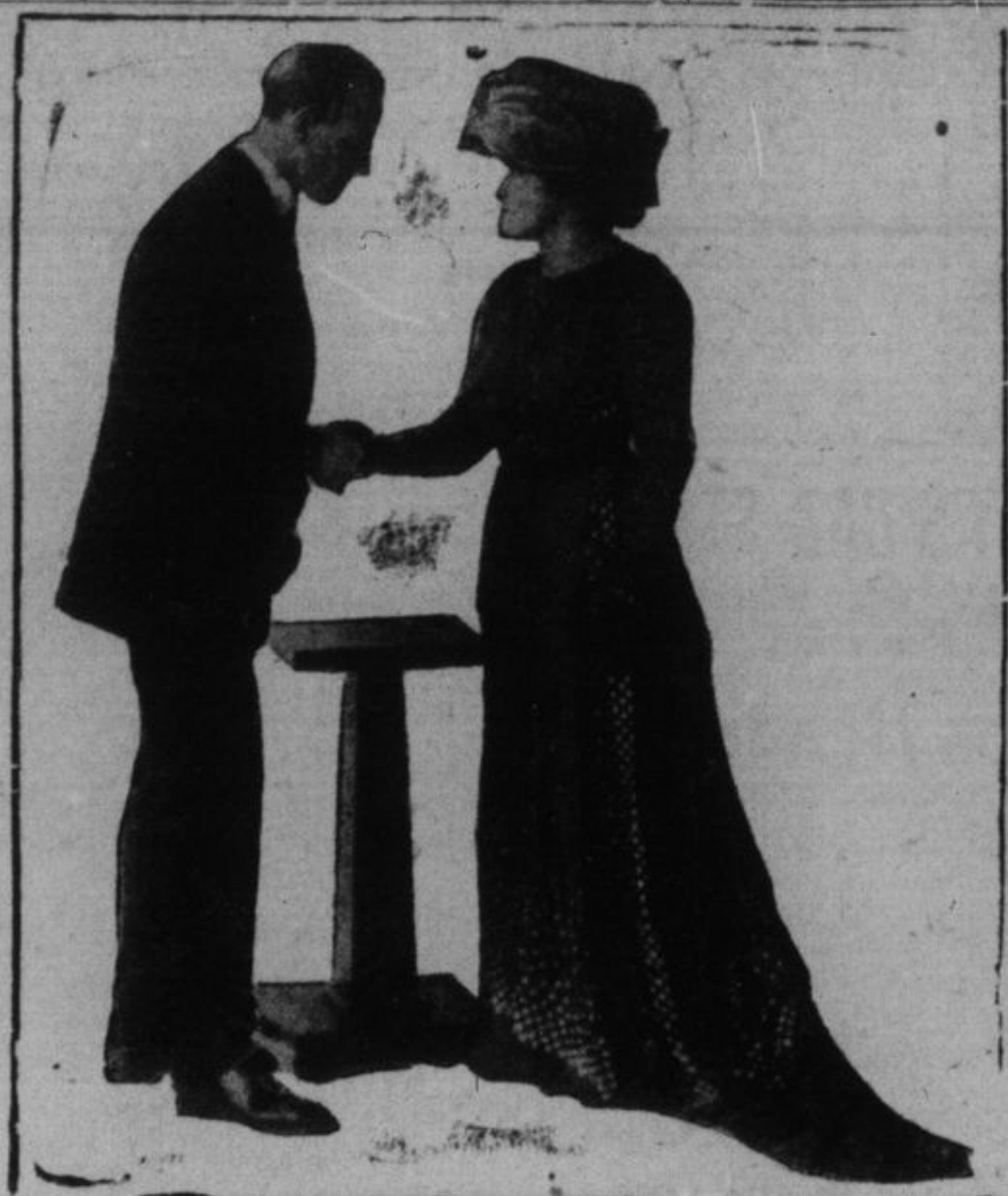
A SCENE FROM "ALIAS JIMMY VALENTINE," AT THE GRAND THEATRE.

F. J. CHENEY & CO., Props., Toledo, O. Sold by Druggists, price 75c. Take Hall's Family Pills for constipation.