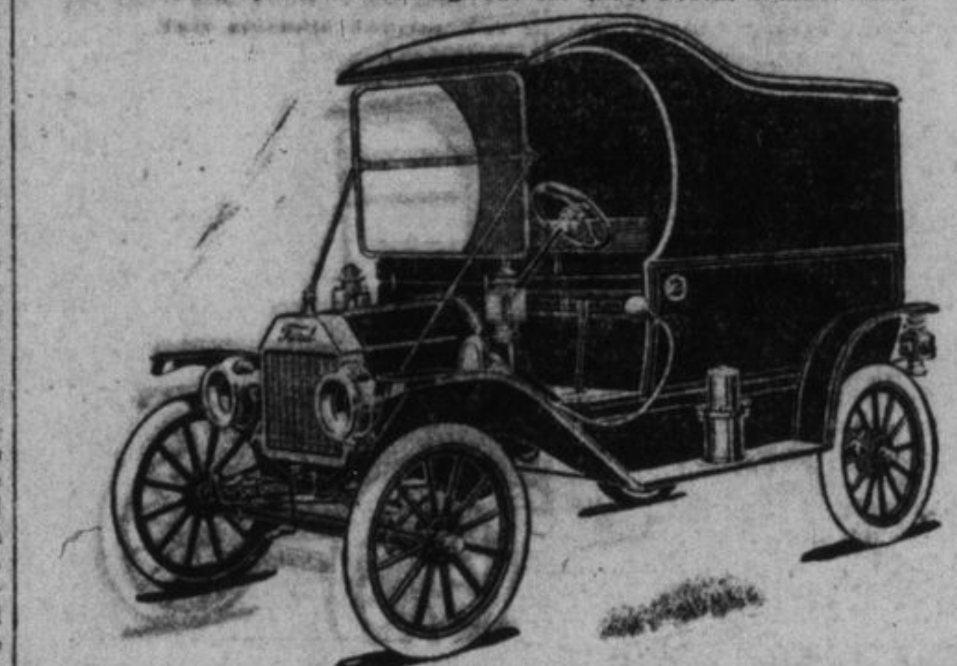
$875 FORD Model T Delivery Car. 4 cylinders, the regular Vanadium Steel constructed chassis which has made the FORD Model T world-famous; steel body, giving roomy interior. Capacity, 150 pounds of merchandise. Complete equipment as follows: Automatic Brass Windshield; Speedometer; Two 6-inch Gas Lamps; Generator; Three Oil Lamps; Horn and Tuba; Ford Magneto built into the motor. And the car complete as above, costs only $875, F.O.B. Walkerville.

Head Office and Factory WALKERVILLE, ONT. Branches and Dealers in all Principal Cities.