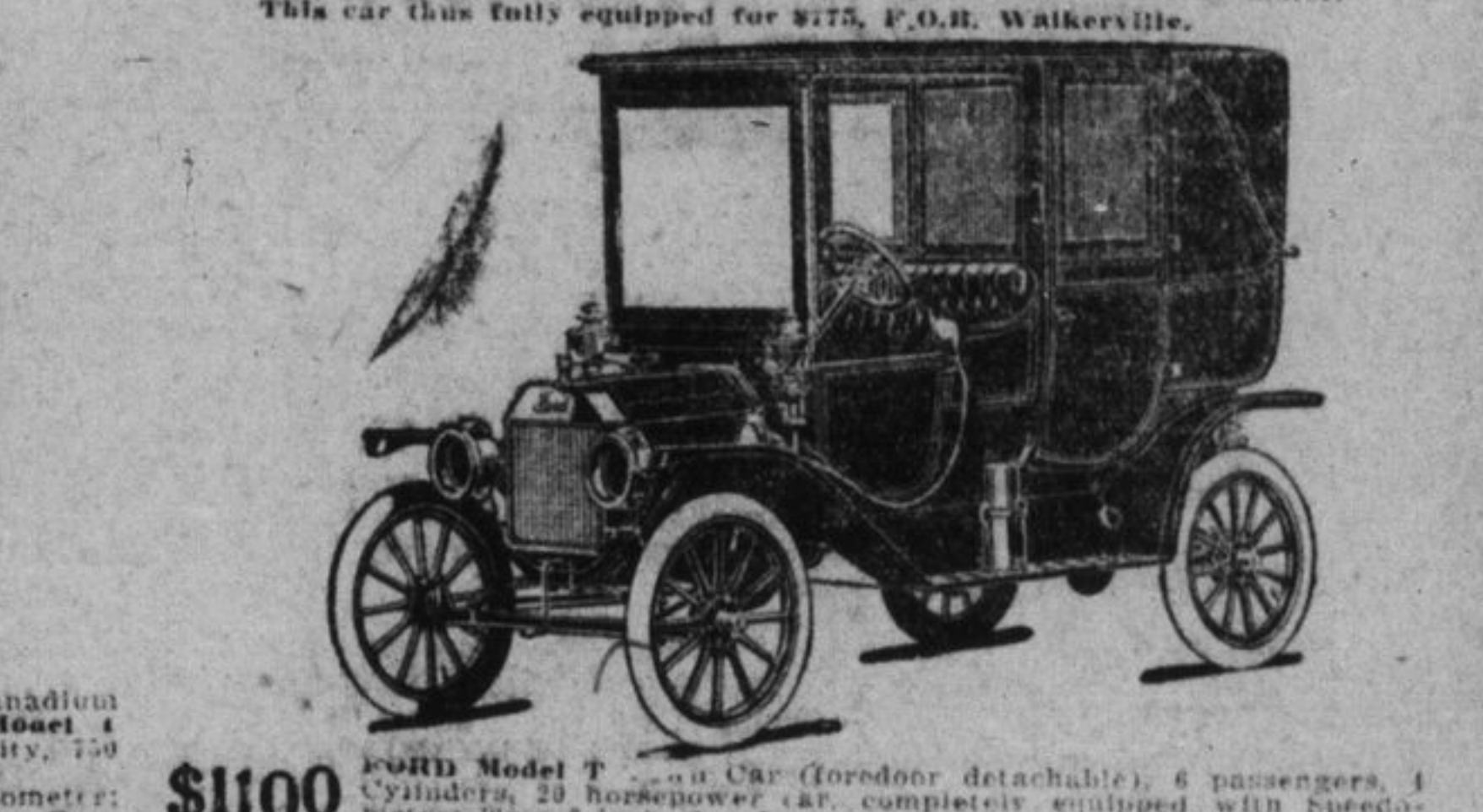
$1100 FORD Model T Sedan Car (fordor detachable), 6 passengers, 4 cylinders, 29 horsepower car, completely equipped with speedometer; Two 6-inch Gas Lamps; Generator; Three Oil Lamps; Horn and Tuba. $1100 F.O.B. Walkerville.

ANGROVE BROS., 88 Princess St., and 123 Clarence Street, Kingston, Ont. See the Ford Exhibit at the Toronto Automobile Show, Feb. 21-28.