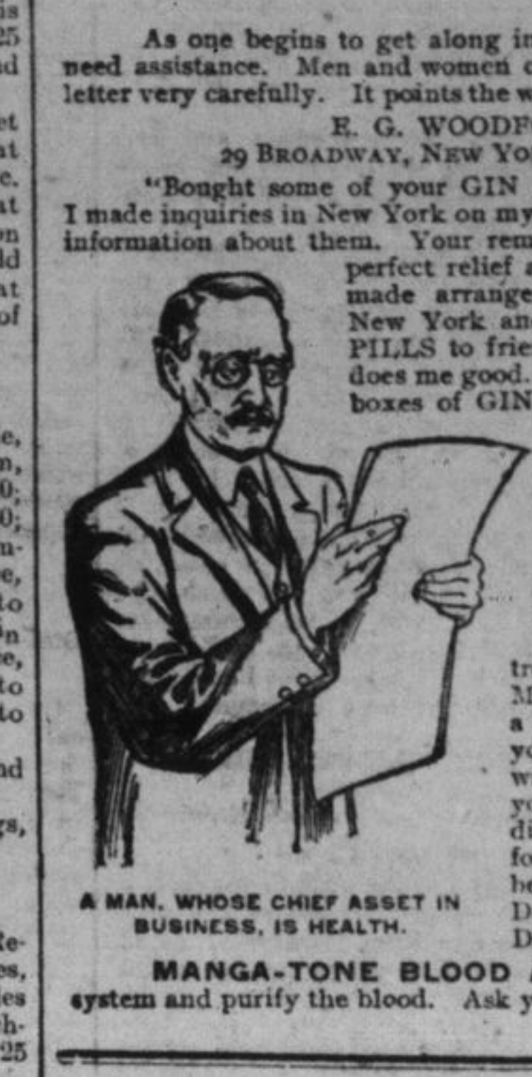
A MAN, WHOSE CHIEF ASSET IN BUSINESS, IS HEALTH.

JANUARY SHOE SALE Men's Regular $5.00 Tan Calf, Patent Colt and Gun Metal Blucher Boots, all new stock, for $3.75 SEE OUR WINDOWS. REID & CHARLES