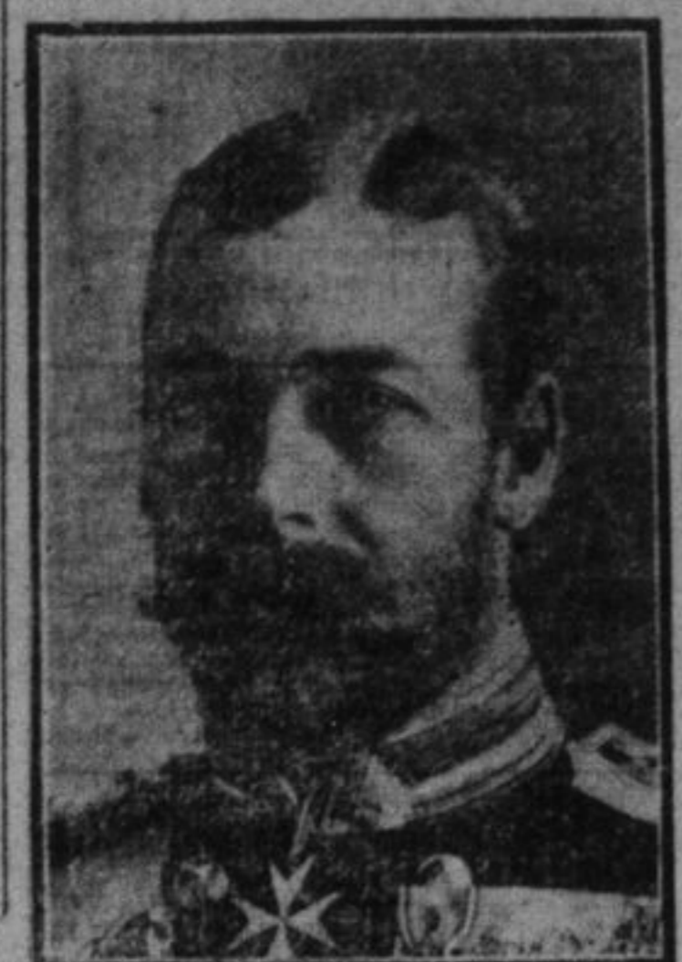
KING GEORGE V.

The Prince of Wales and His Brother Will Likely Come Over in 1913 on an Empire Tour—Good Tidings.