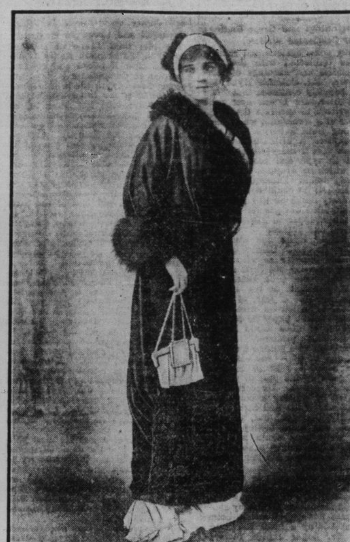
SEMI-HOBLED EVENING COAT OF BLACK SATIN. This really practical looking evening coat of black satin is made in two sections at the waist line under a satin cording. The upper portion has seams running straight from the throat, across the shoulders and down the outside of the arm to below the elbow and a low-rolling front terminating at the waist and bordered with Alaska sable. The lower section has straight fronts trimmed to the knees with rat-tail heading and the full backs are partially drawn forward and full-fitted into the side seams between the knees and the hem of the garment. The bandeau of white satin ribbon matches the silver lace draped white satin gown.

GOVERNMENT BY COMMISSION. Stratford Council to Submit Question to Ratepayers. Stratford, Oct. 18.—Stratford council took the first definite step towards government by commission, when it adopted a resolution to appoint a committee to consider and report upon the advisability of vesting in one board of commissioners the jurisdiction at present exercised by the city council, water commissioners, light and heat commission, police commission and park commission, with a view to submitting the recommendation of the committee appointed to a vote of the ratepayers at the municipal elections in January.