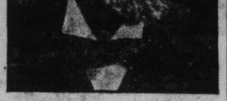
HON. GEORGE E. FOSTER, Minister of trade and commerce.

Northern construction camp near Colwood, B. C.