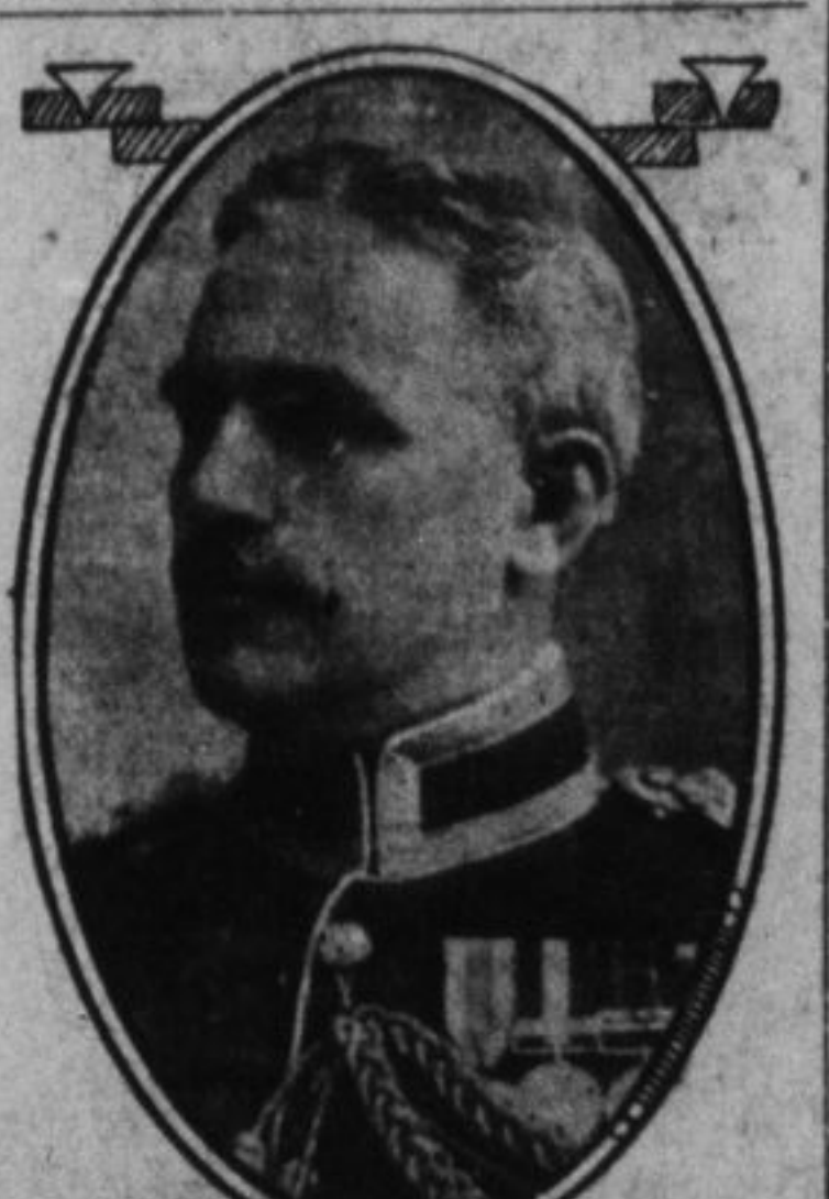
COL. SAM. HUGHES, M.P., Minister of Militia.

Toronto Aggrieved. Toronto, Oct. 11.—W. T. White's promotion is not being taken in good