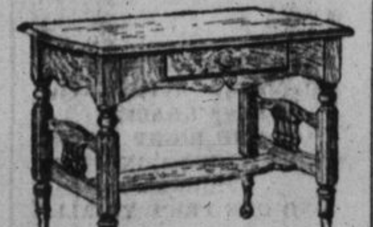
PARLOR TABLES. Surface Oak, Mahogany and Circassian Walnut, $1.50 up to $25.

RUGS, CURTAINS, CARPETS, LINOLEUM, etc., all cut in price. Yours, T. F. HARRISON CO.