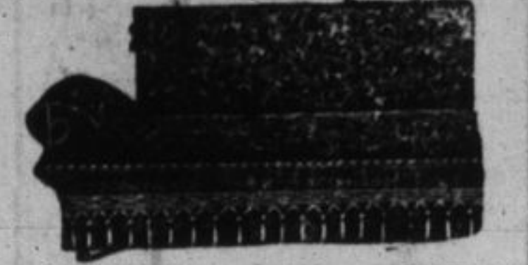
COUCHES AND FOLDING DAYENPORTS and all the latest space savers—Couch by Day and Bed by Night $14, $17, up.