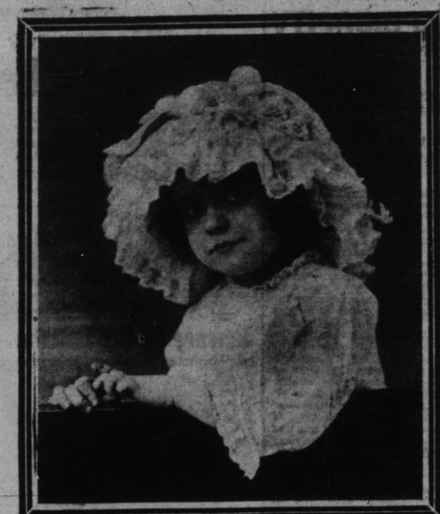
THE LITTLE MAID'S SLOPPY BONNET.

There are but few sure things in this old world. One of them is the uncertainty of a woman's age.