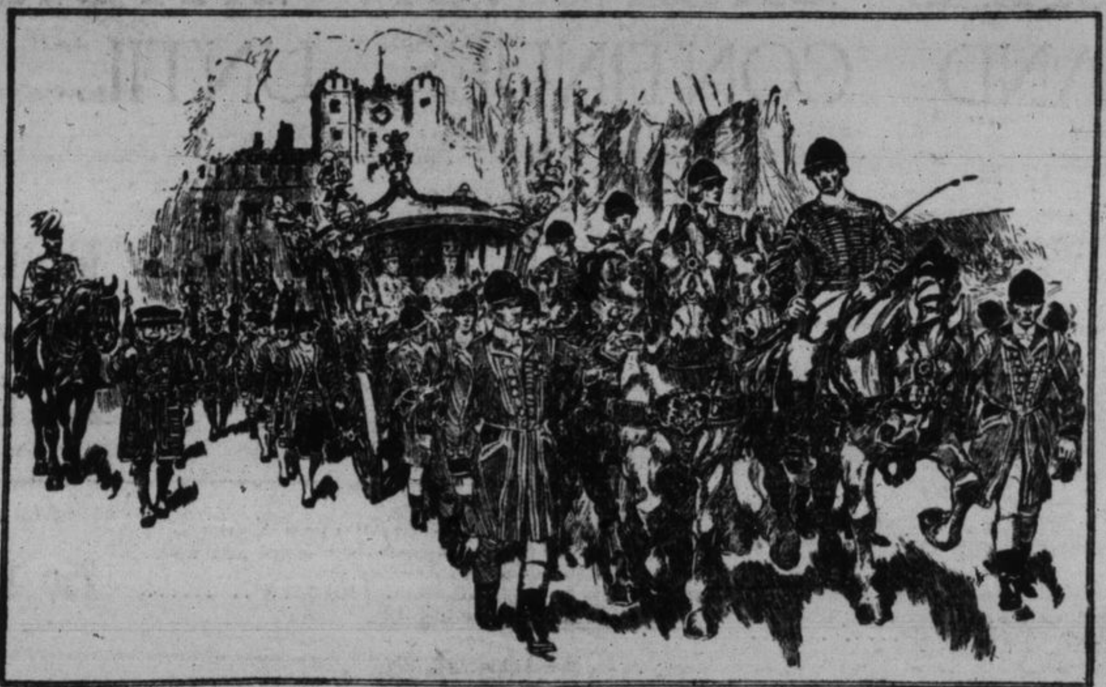
THE KING AND QUEEN PASSING ST. JAMES' PALACE ON THEIR RETURN FROM THE ABBEY. Their Majesties Wearing the Crowns After the Coronation Ceremony, are Here Shown in the Famous State Coach With its Eight Cream Horses.

At Crow Lake. Crow Lake, July 4.—Farmers throughout this vicinity are wearing