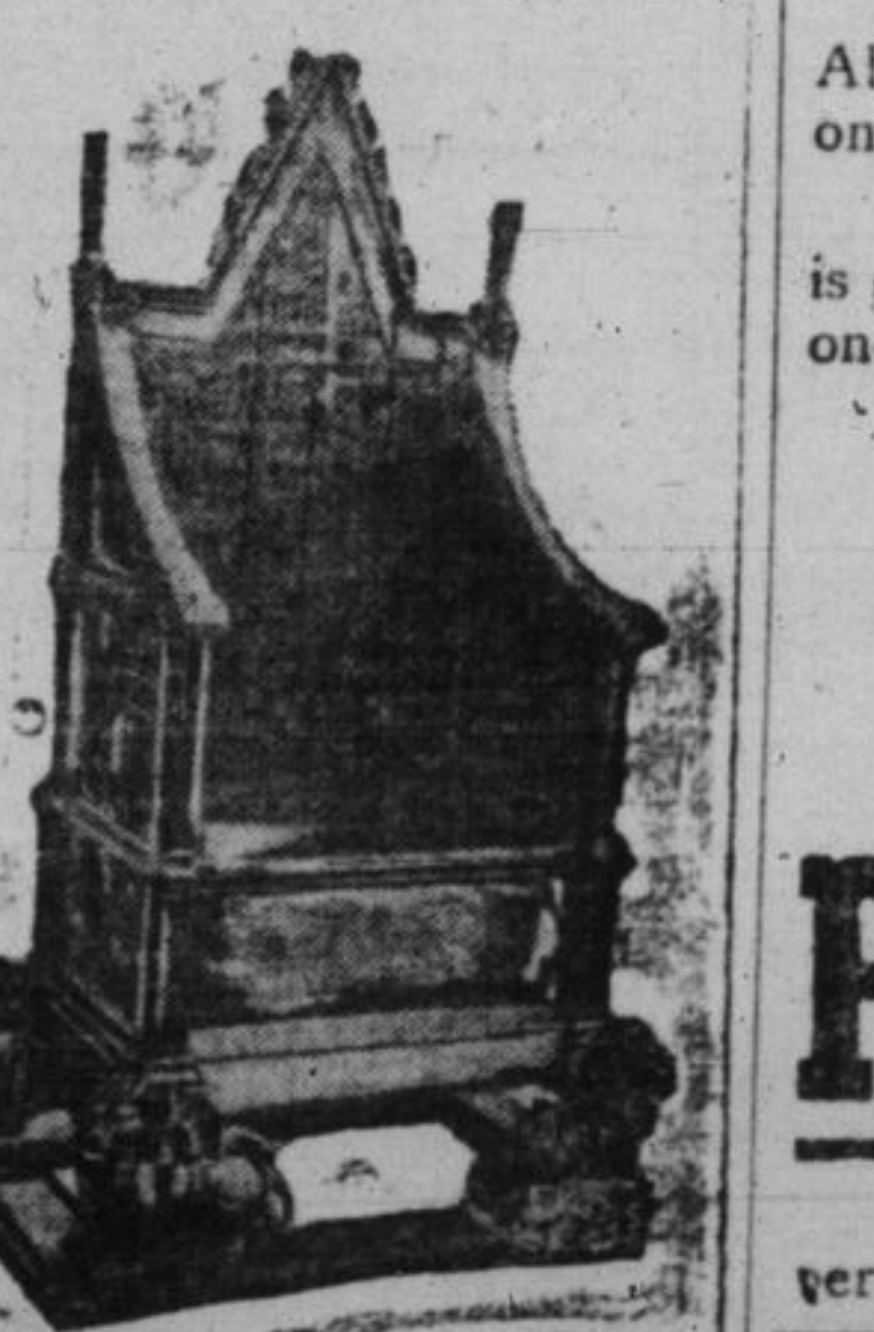
CORONATION CHAIR, IN WHICH REIGNING MONARCHS HAVE BEEN CROWNED SINCE EDWARD I.

After communion the king descends from his throne and, wearing the crown and carrying the scepter and rod, goes into St. Edward's chapel, followed by a great procession of bishops, peers