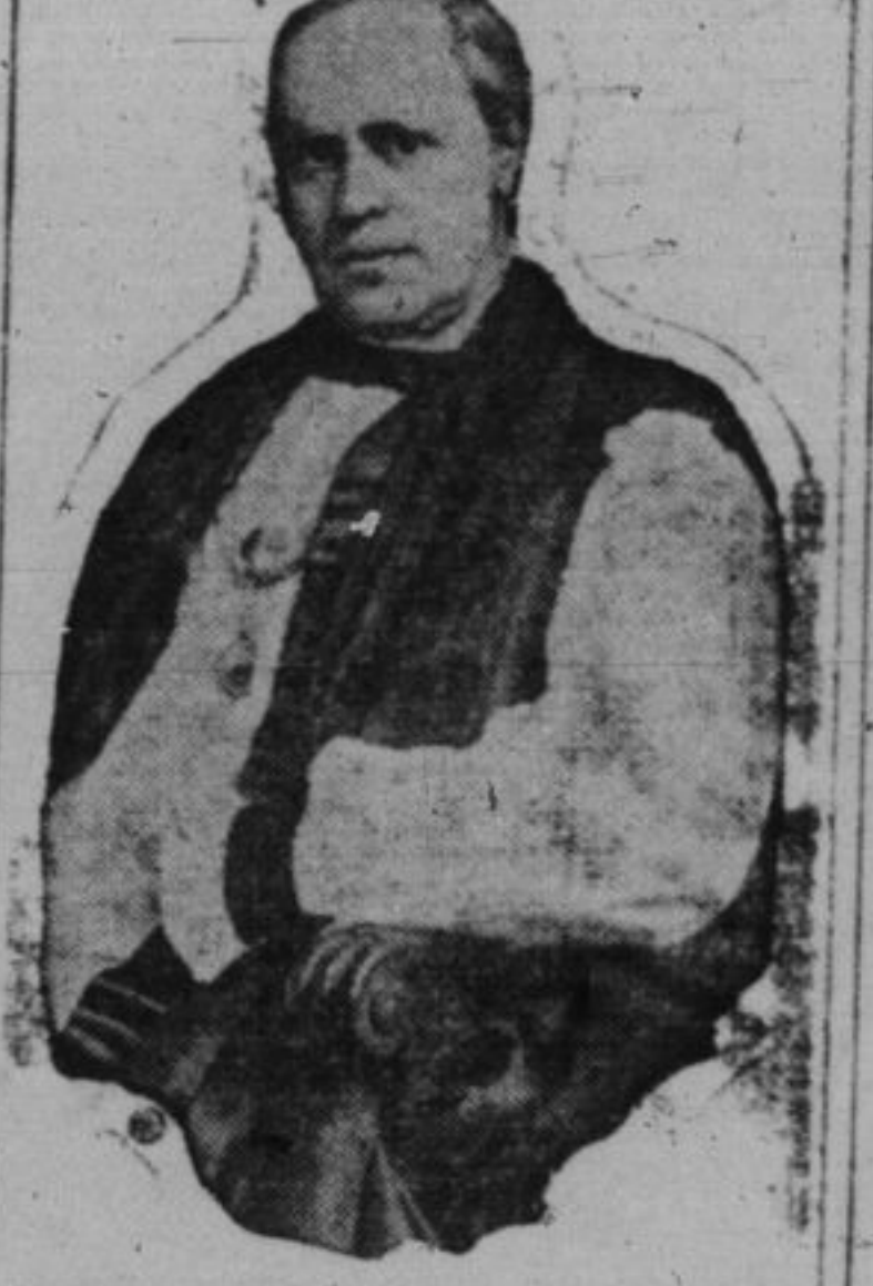
THE REV. RANDALL T. DAVIDSON, ARCHBISHOP OF CANTERBURY, WHO WILL CROWN THE KING AND QUEEN.

coronets, and the trumpets shall sound, and by a signal given the great guns at the Tower shall be shot off. The acclamation ensuing, the archbishop shall go on and say: "God crown you with a crown of glory and righteousness, that by the ministry of this our benediction, having a right faith and manifold fruit of good works, you may obtain the crown of an everlasting kingdom by the gift of him whose kingdom endureth forever. Amen." Then shall the choir sing: "Be strong and play the man; keep the commandments of the Lord thy God and walk in his ways and thou shalt prosper." The dean of Westminster takes the Holy Bible from the altar and gives it to the archbishop, who presents it