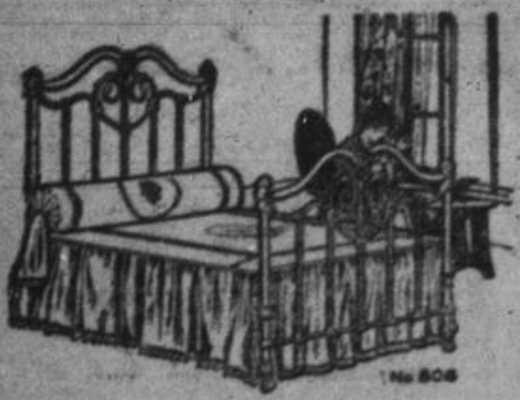
Made in 98 different styles.

Make your own choice from the 98 different styles of "Ideal" Metal Beds. At whatever price you decide to pay, from $3.00 up, you will find a design that invites your admiration—and deserves it, too.