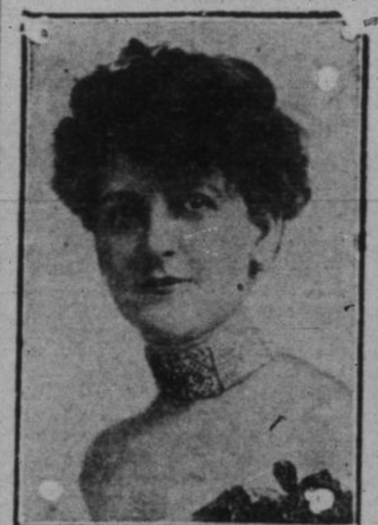
MISS MAY ROBSON.

The London Standard says: "The Rejuvenation of Aunt Mary" was certainly a surprise, pathetic and dramatic incident, follow unfolding the story, while May Robson as the New England spinster, dominates and holds the humor; occasionally little bits of pathos creep in here and there as a relief from excessive laughter. Per-