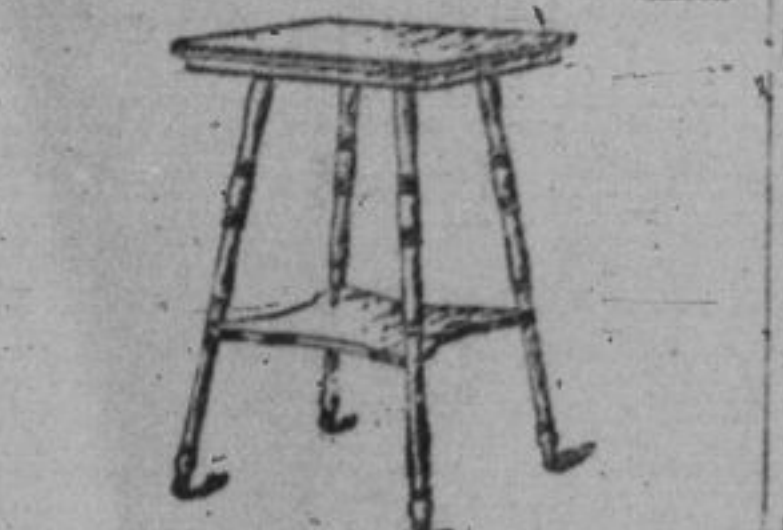
Tables for Hall, Parlor, Dining-room. Chairs to match.