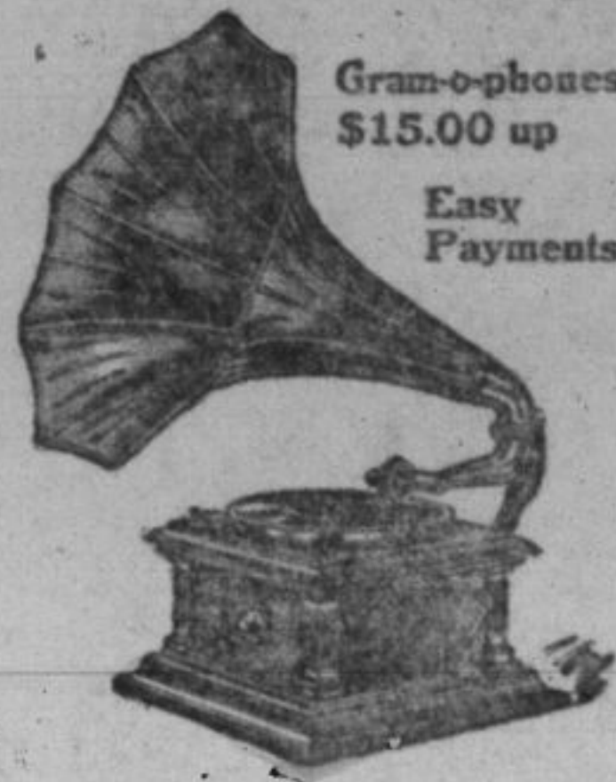
Gram-o-phones $15.00 up