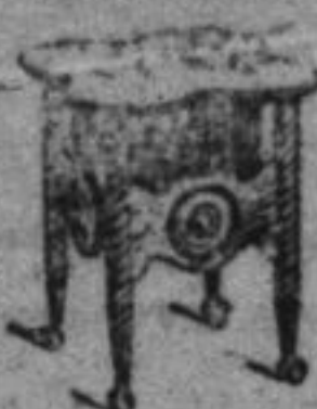
Jardiniere Stands, 50c., 75c. up.