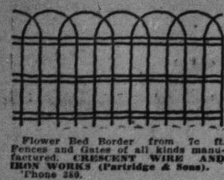
Flower Bed Border from 7c to $1. Fences and Gates of all kinds manufactured. CRESCENT WIRE AND IRON WORKS (Partridge & Sons), Phone 249.