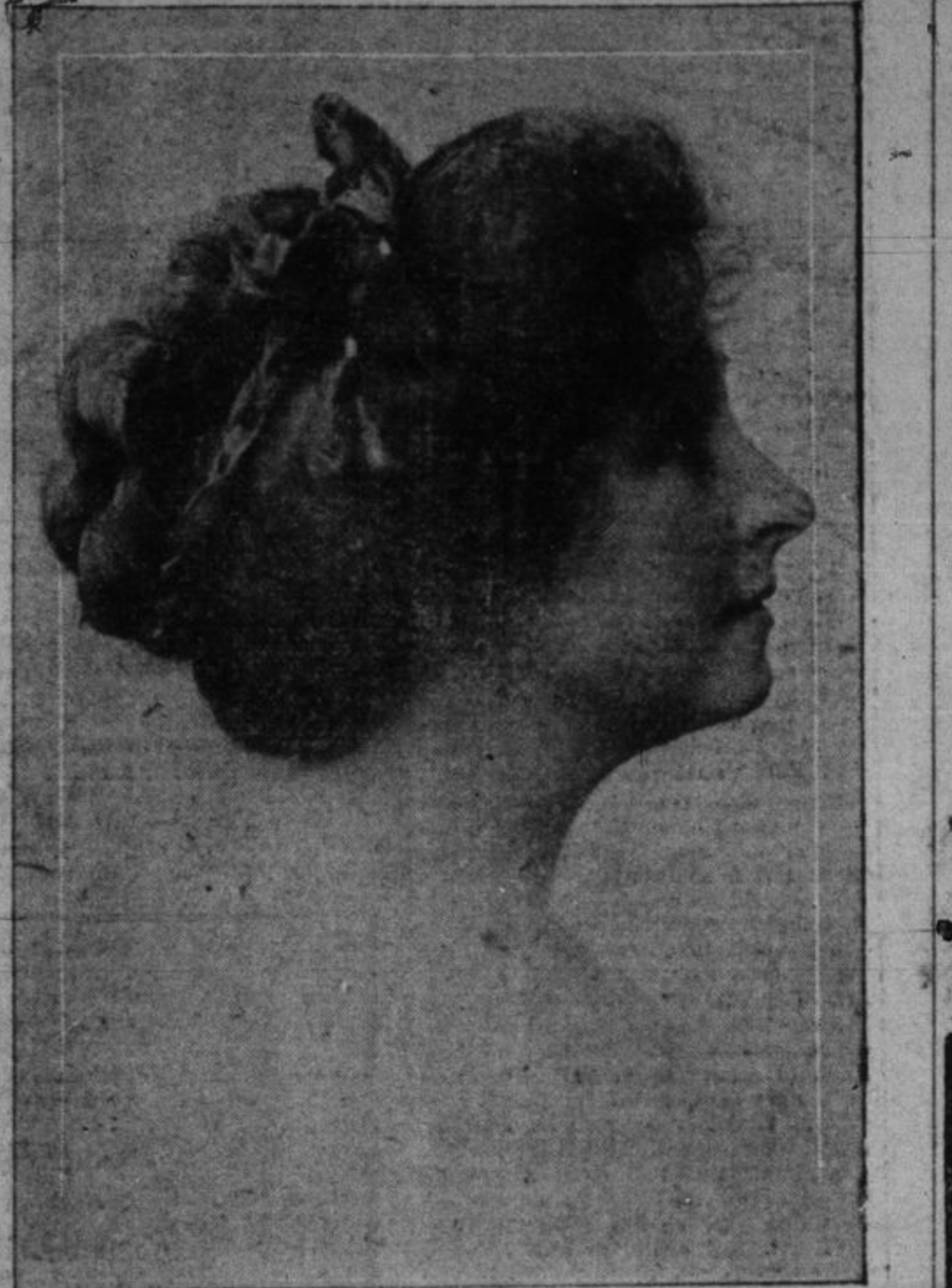
OLIVE TEMPLE Grand, on Thursday, October 13th.

Cuticura Soap and Ointment Guard the epithelium and prevent superficial treatment for eruptions of the skin and eyes. A single tablet of Cuticura Soap and box of Cuticura Ointment are sufficient. Sold throughout the world. Foster Drug & Chem. Corp., 200, N. 2nd St., Boston. Send for free 25-page book on the scientific treatment of skin diseases.