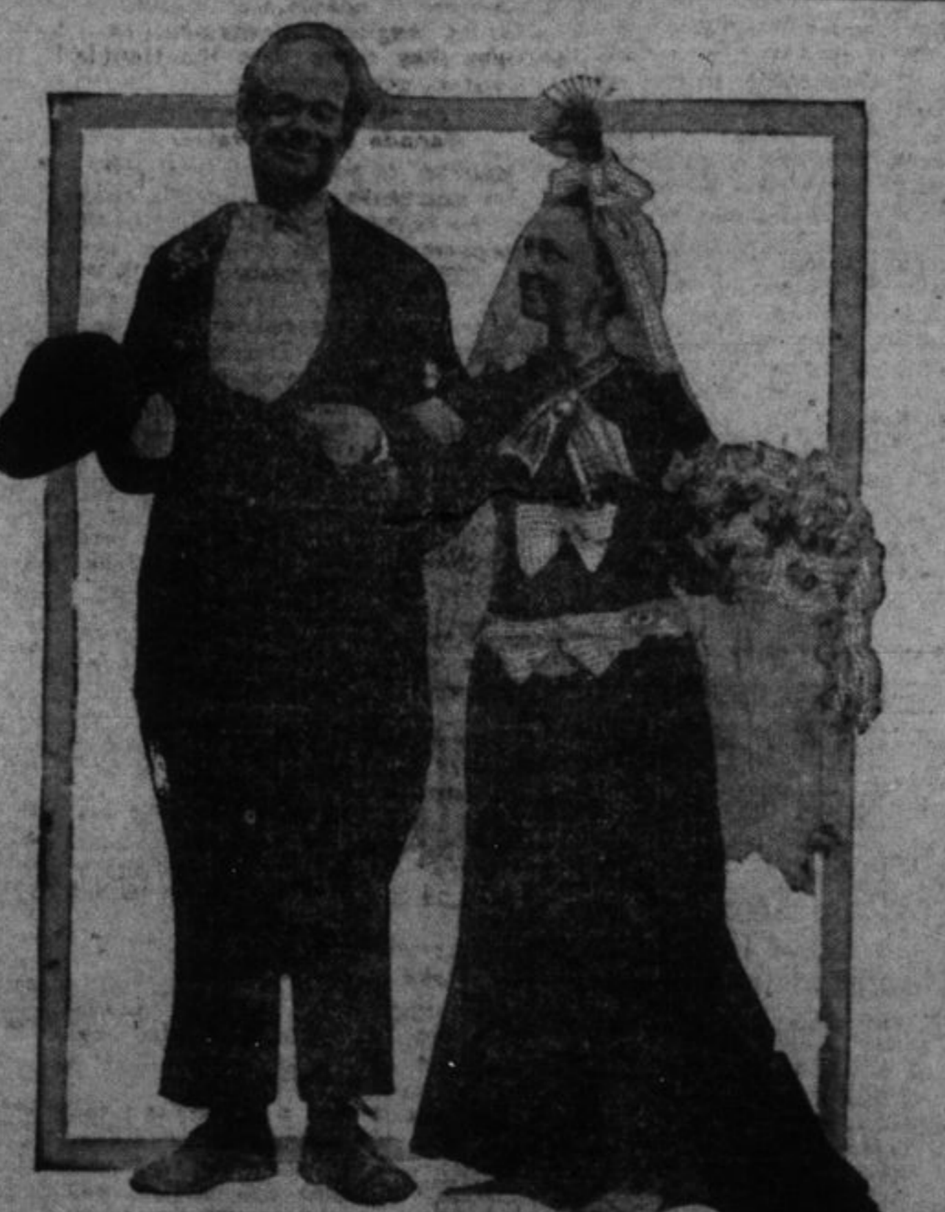
MRS. HAZY AND MISS STUBBINS. They appear in "Mrs. Wiggs of the Cabbage Patch," at the Grand on Monday, Sept. 26th.

Long hours of labor mean short hours of life.