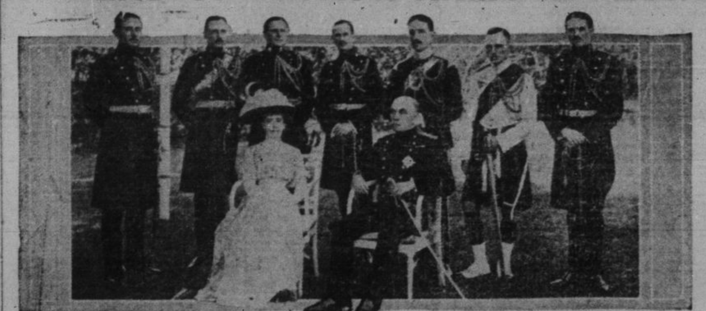
SIR O'MOORE CREAGH, COMMANDER OF BRITISH FORCES IN INDIA. General Sir O'Moore Creagh has been commander-in-chief of the British forces in India since last year. In the photograph he is seated with Lady O'Moore Creagh and his staff.