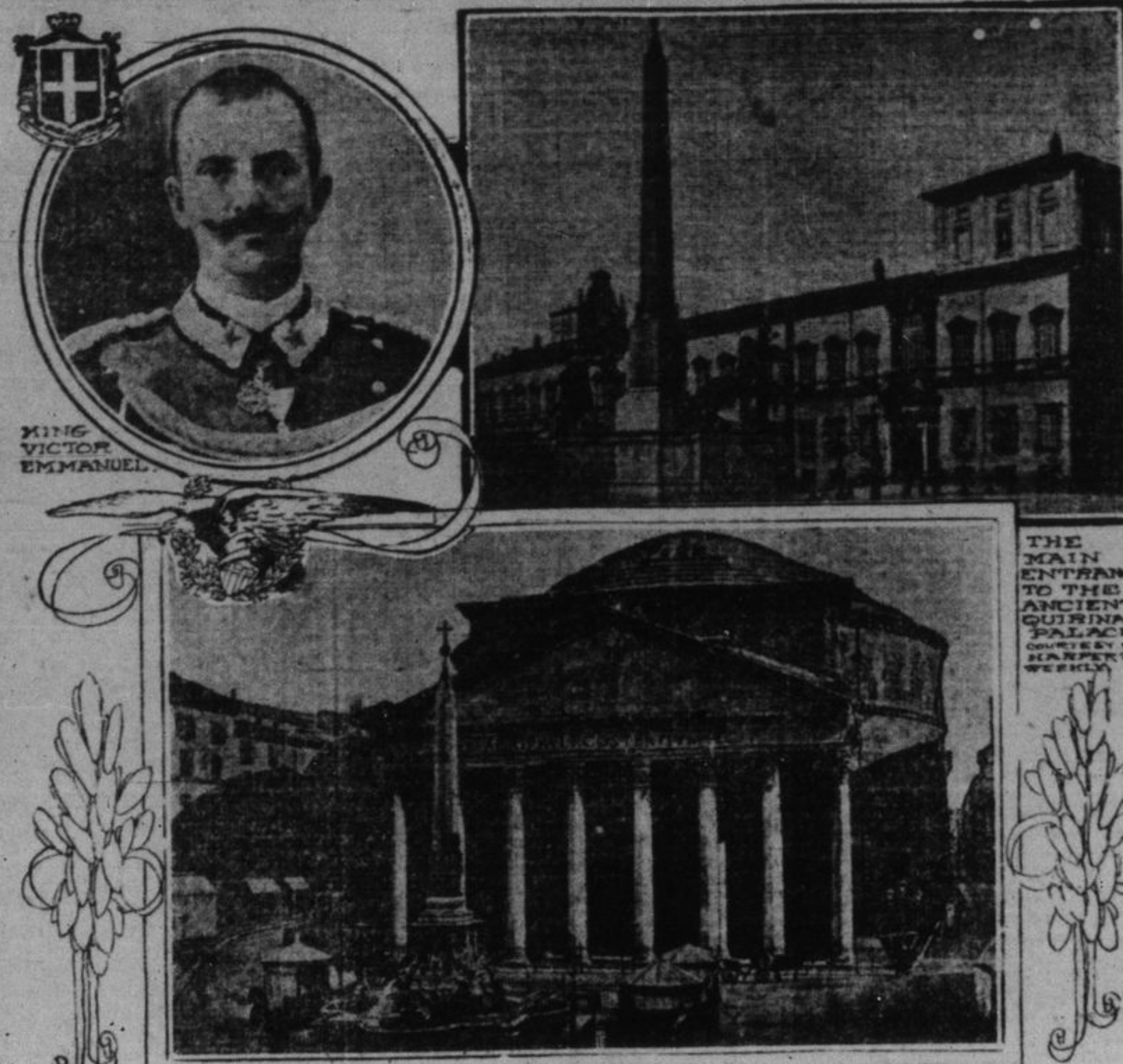
The Pantheon and the Main Entrance to the Ancient Quirinal Palace, two places of interest visited by Roosevelt while in Rome, and King Victor Emmanuel, of Italy, who received the colonel in audience.