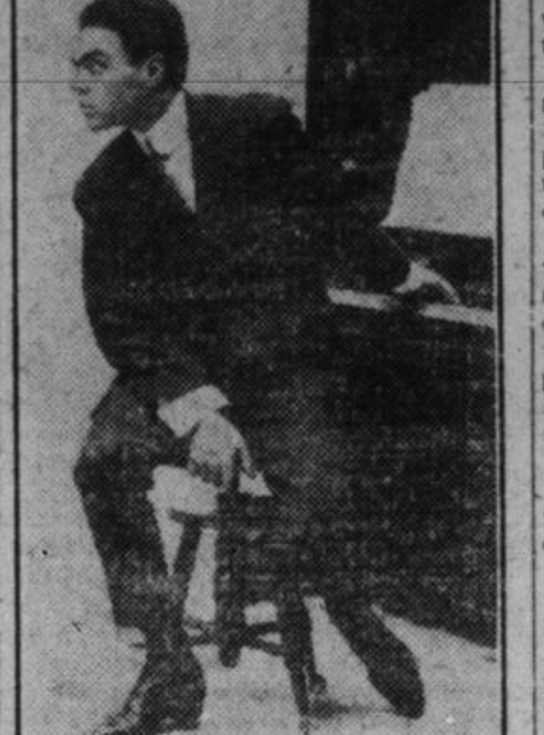
A scene from "The Climax" at the Grand on next Friday and Saturday evening and Saturday matinee.