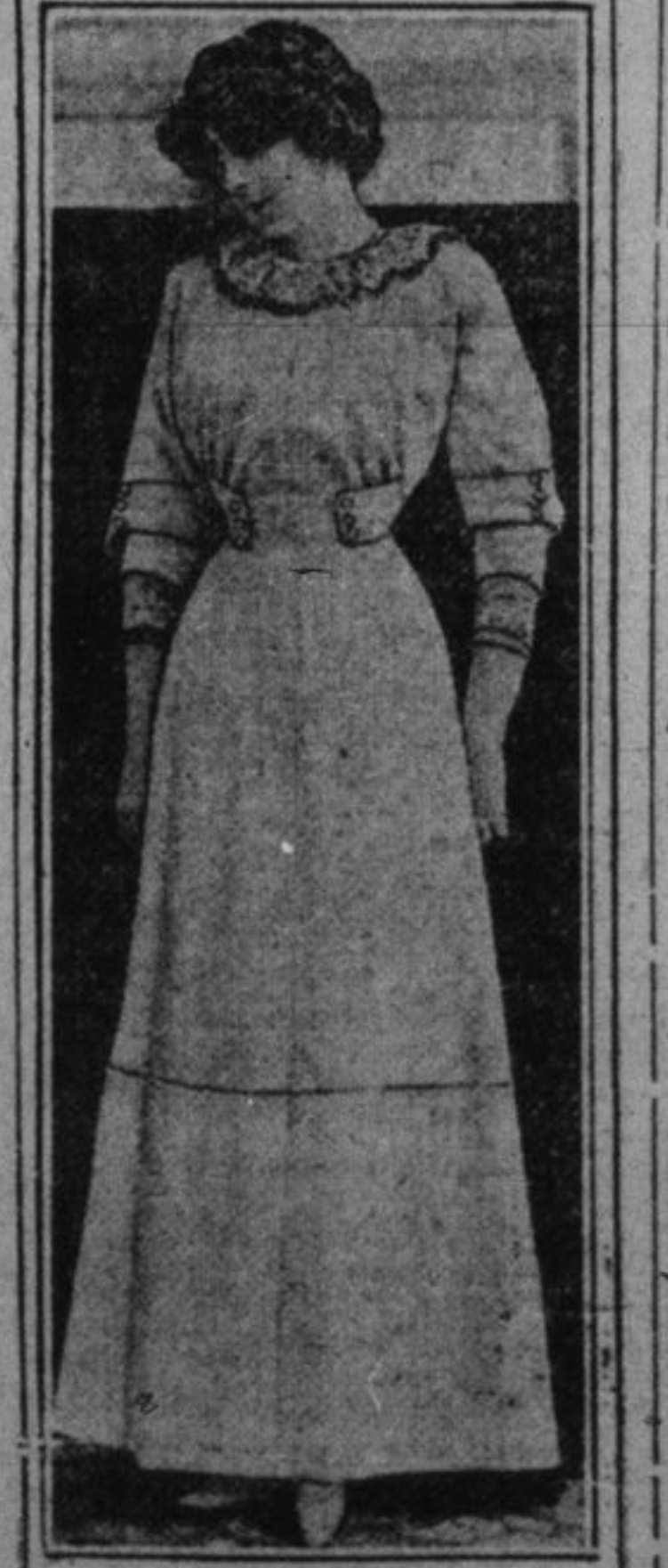
EMBROIDERED WHITE CLOTH GOWN.