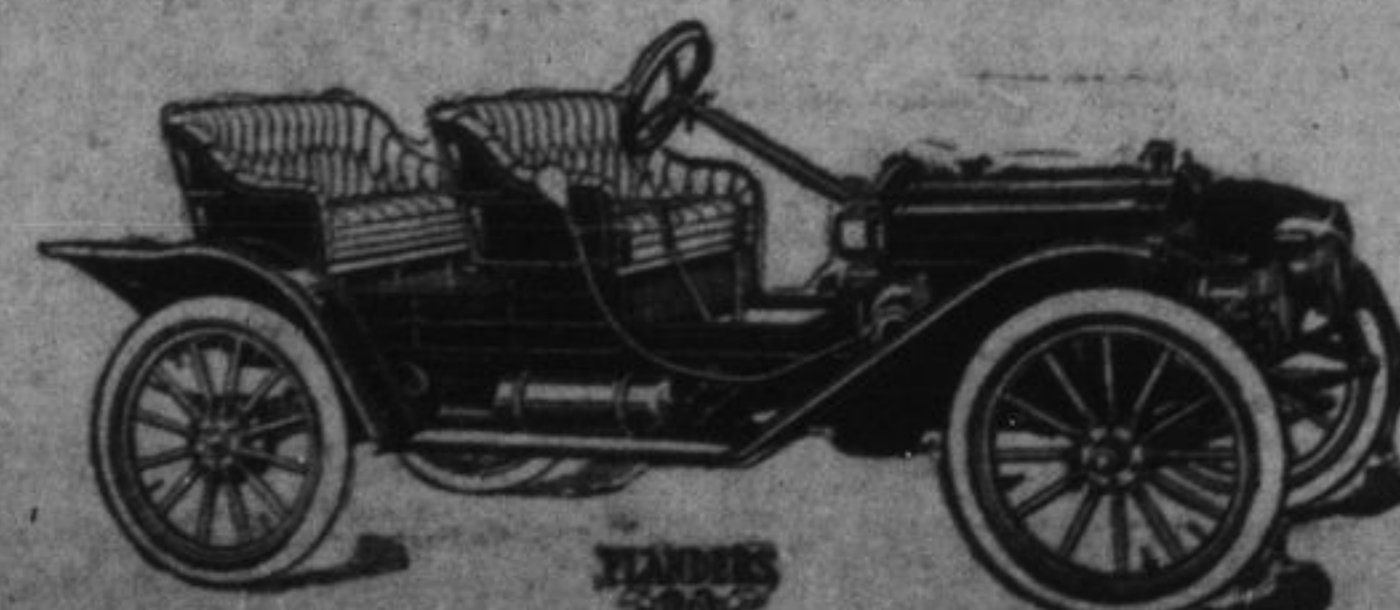
Flanders "20" Suburban, $1,000 F. O. B. Walkerville, Ont.

Dealers wanting to secure this line are advised to see us and our exhibit of E-M-F "30" and Flanders "20" stripped chassis and finished cars at Toronto and Montreal Automobile Shows.