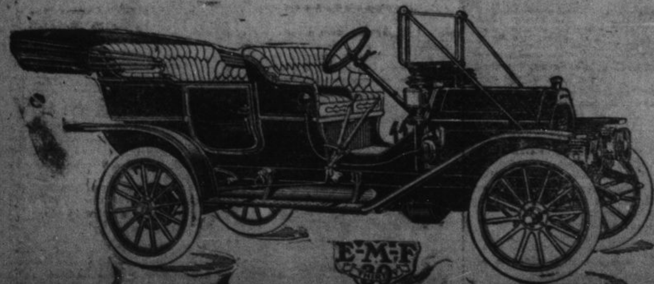
E-M-F "30" Touring Car, $1,500 F. O. B. Walkerville.