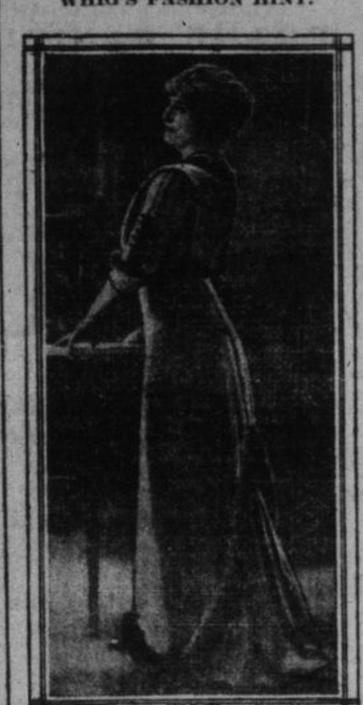
Green cashmere de sole gown.