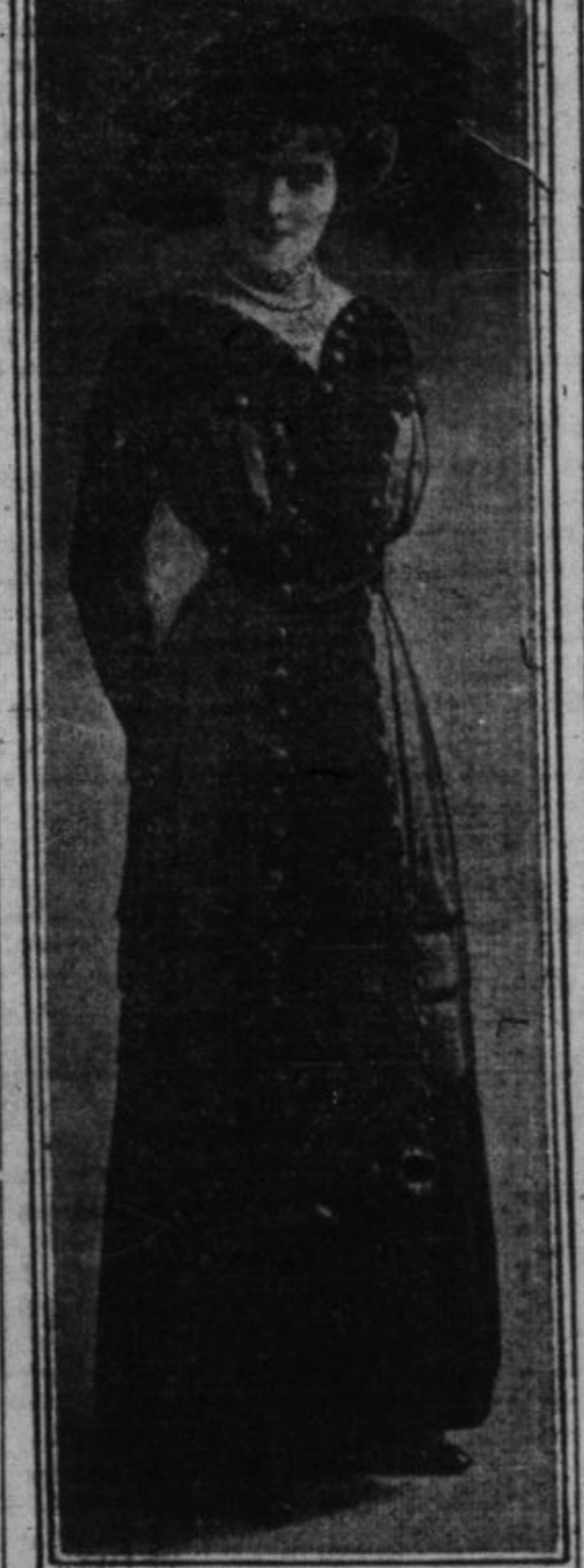
Blue silk voile gown, with velvet trimmings.