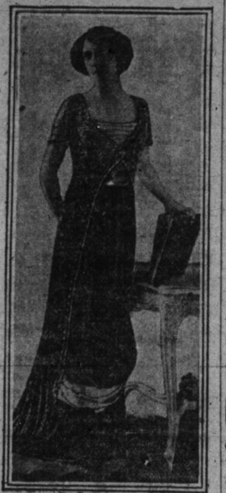
Black Crepe-de-Chine Gown, with silver paillettes.