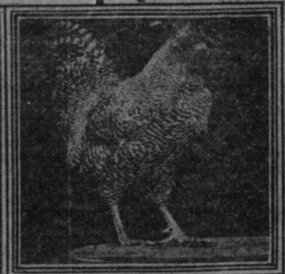
THROUGH ROCK COCK.

Residents in the vicinity of Madison Square Garden, New York, were never more disturbed by political gatherings in that historic building than during the twenty-first annual exhibition of the New York Poultry, Pigeon and Pot Stock Association.