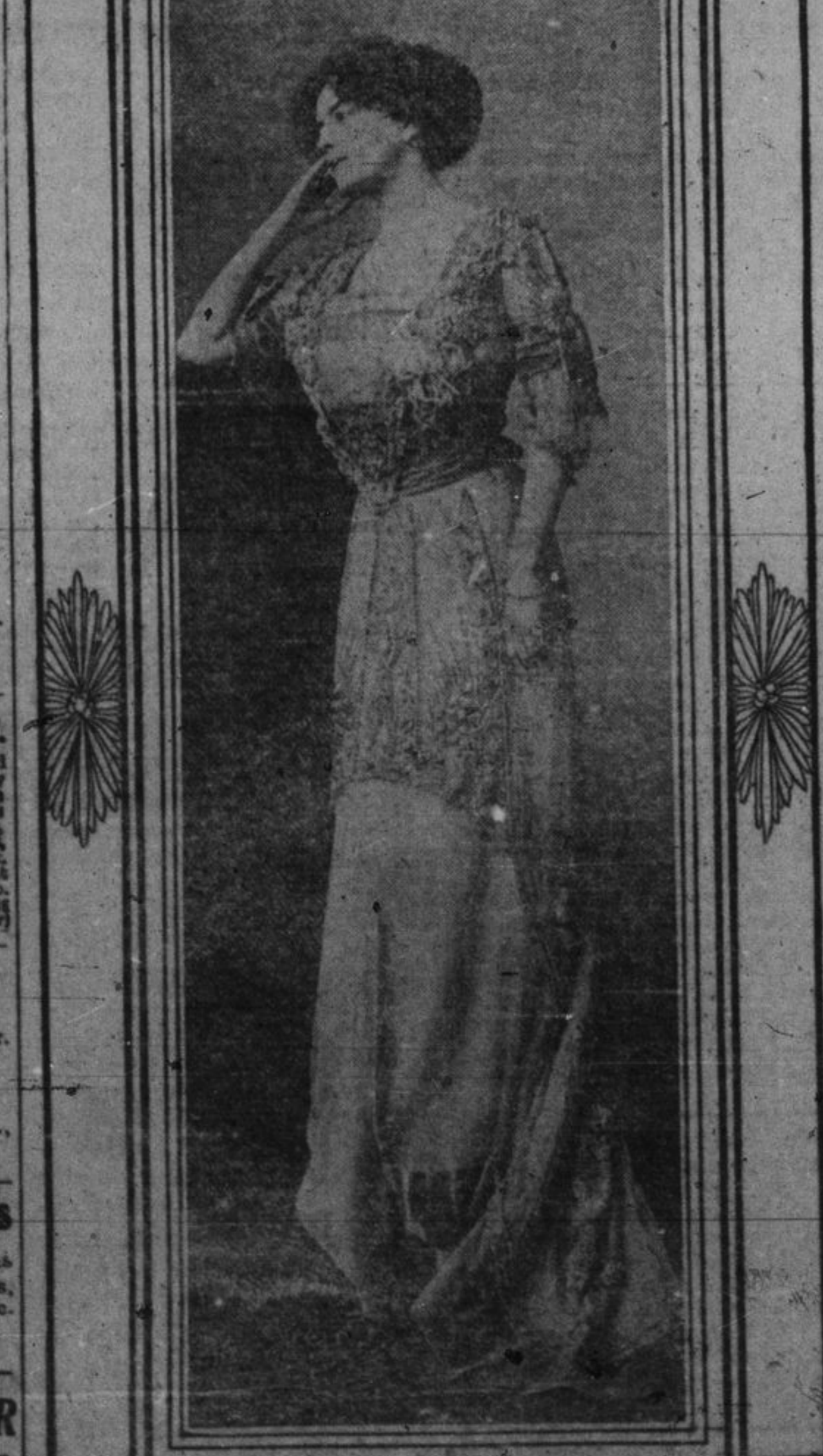
The craze for combining sheer and heavy stuffs, such as velvet and chiffon, is exemplified in this sumptuous costume. For steel sponged gray chiffon is draped over blue satin, and steel blue velvet and embroideries in the same shade give weight to the chiffon overdress, which sweeps heavily around the feet, clinging to the figure. The trimming on the bodice is intricate and includes blue embroidery, velvet motifs and tiny balls or bugles in steel gray color, which are mixed with the embroidery.