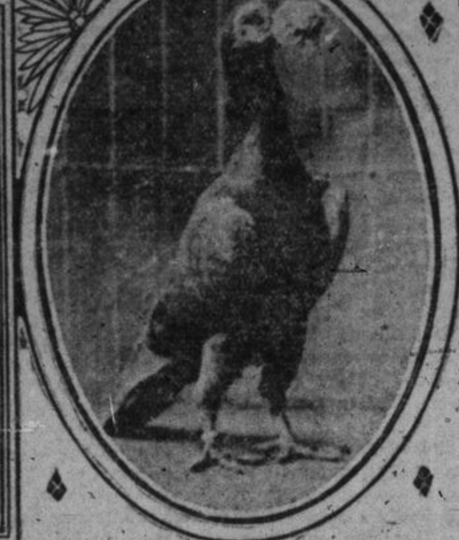
OUR FAVORITE COCK—TWO YEARS OLD—JACOB WILKINSON, NEW ROCHELLE, N. Y.

might be termed a "toothsome" habit. The turkeys are equally inviting, but the centre of the whole show is the hen.