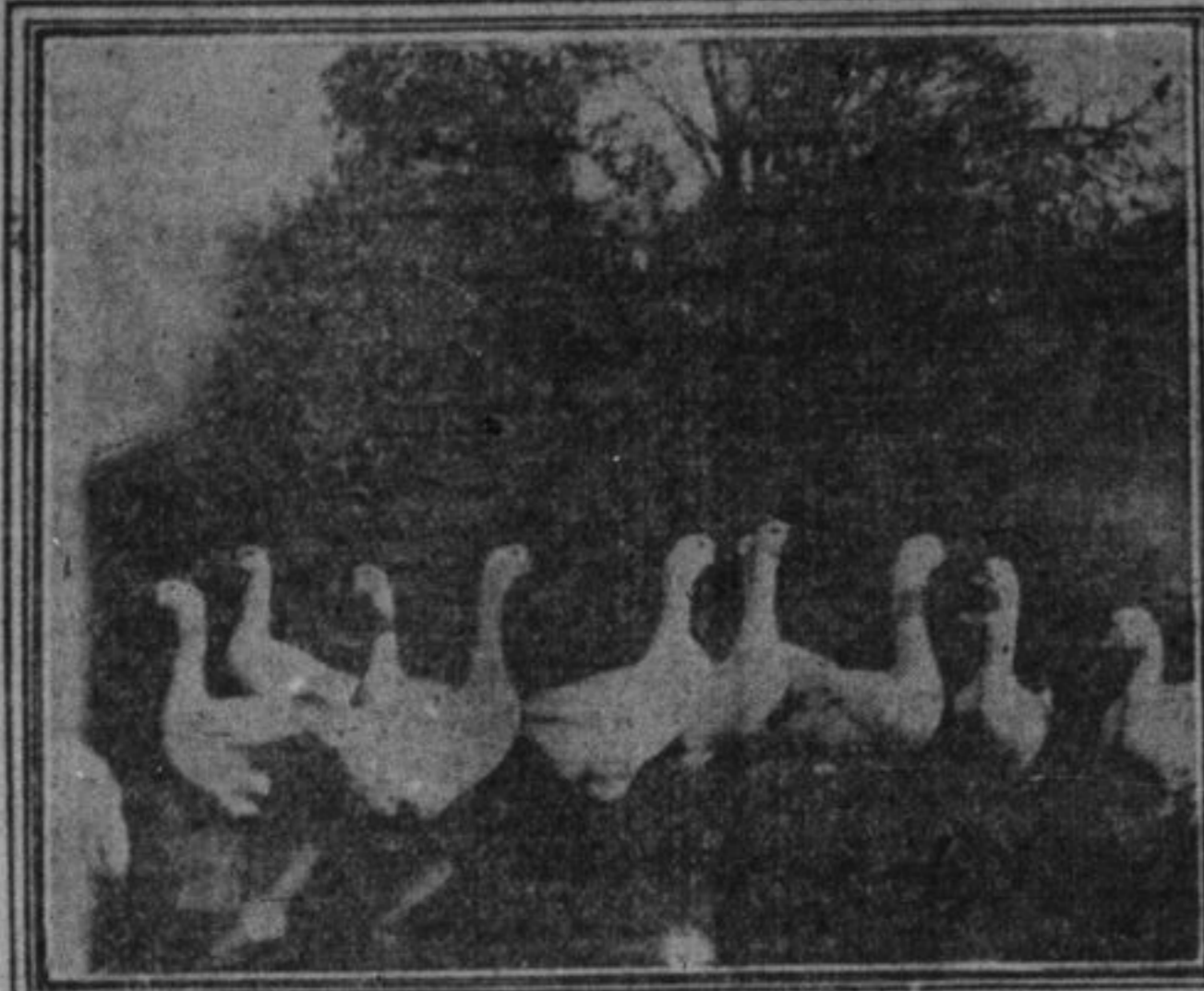
EMDEN WELSH BARON QUALITY CHICKEN, N. Y.

Residents in the vicinity of Madison Square Garden, New York, were never more disturbed by political gatherings in that historic building than during the twenty-first annual exhibition of the New York Poultry, Pigeon and Pot Stock Association.