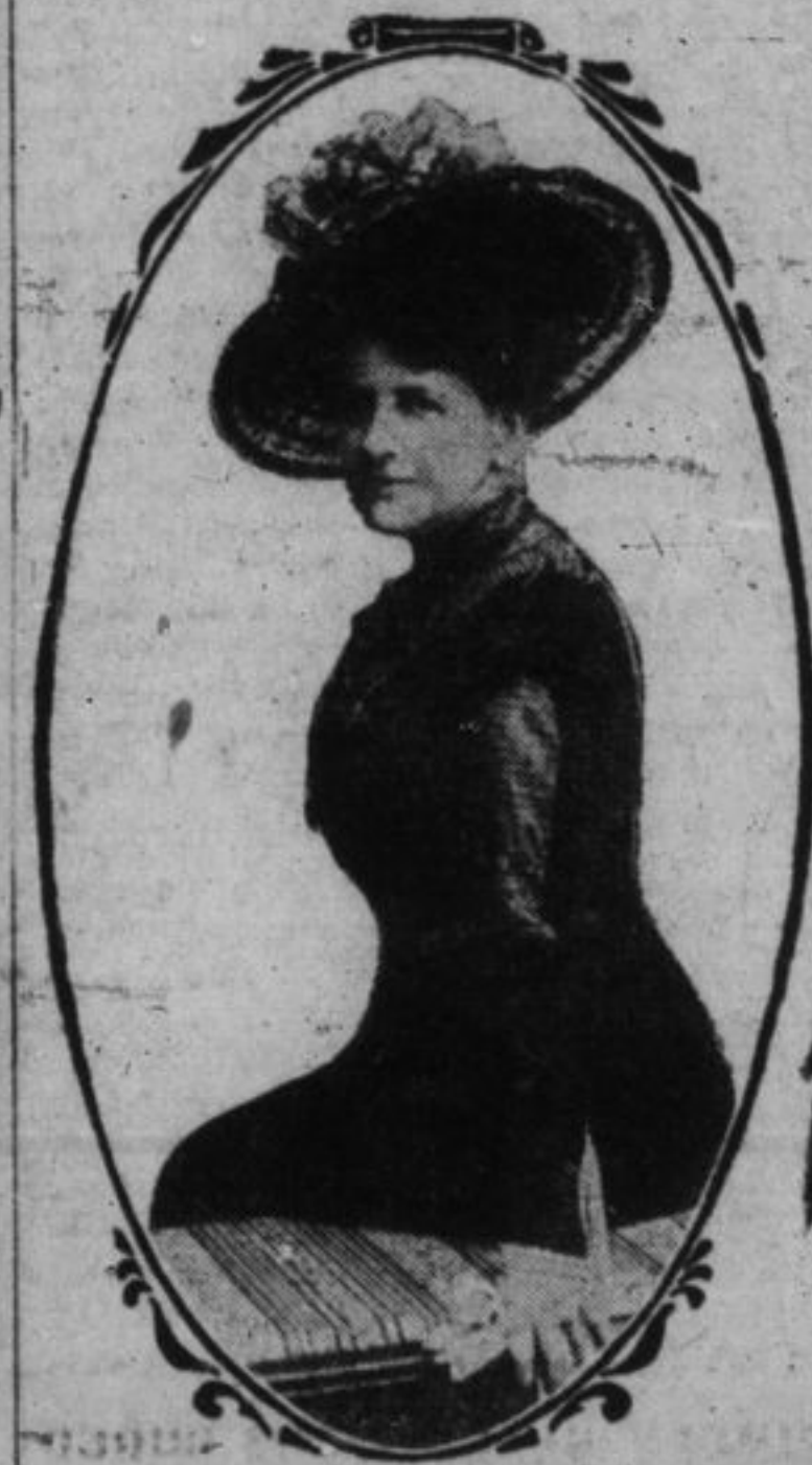
MAY ROBSON In 'The Rejuvenation of Aunt Mary.'

New Year's Day, Matinee and Night. 'The Arrival of Kitty' will be the attraction at the Grand on New Year's day, matinee and night.