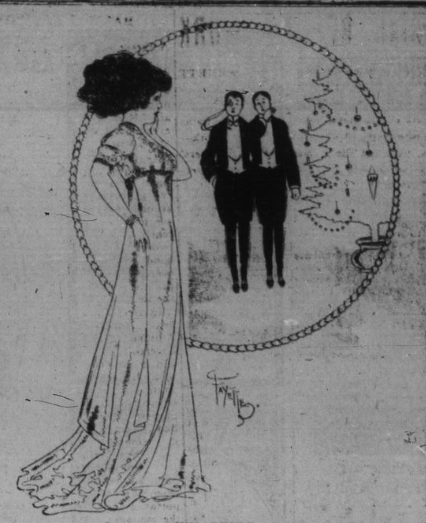
HER REPLY. Percival—Miss Josh is rawther-w-deuse, doncher think? Reginald—Well, she is. When I awked her lawst night if I-aw-might be her Christmas present, she nevah saw the point at all. She replied that she'd rawther have something useful than ornamental, doncher know?

By local applications, as they cannot reach the diseased portion of the ear. There is only one way to cure deafness, and that is by constitutional remedies. Deafness is caused by an inflamed condition of the mucous lining of the Eustachian Tube.