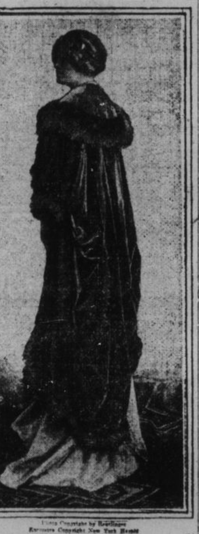
Red velvet opera cloak with slunk fur.