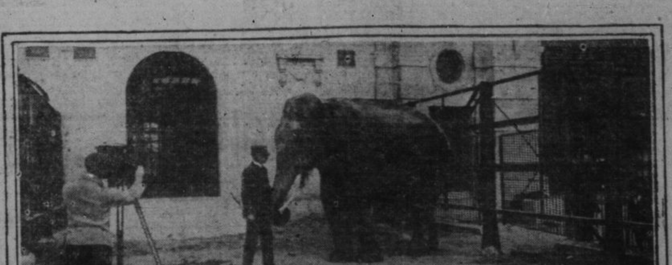
TAKING A MOVING PICTURE OF GUNDA, THE BIG MALE ELEPHANT AT THE BRONX ZOO.