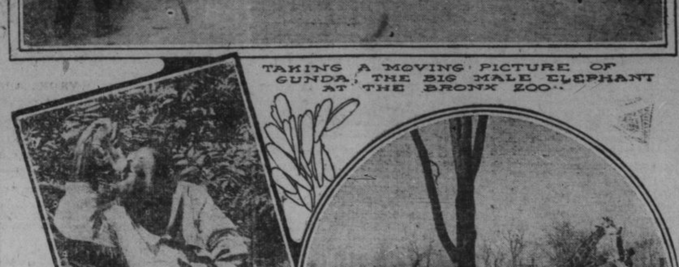
TAKING A MOVING PICTURE OF ONE OF THE GIRAFFES FEEDING THE BANANAS.