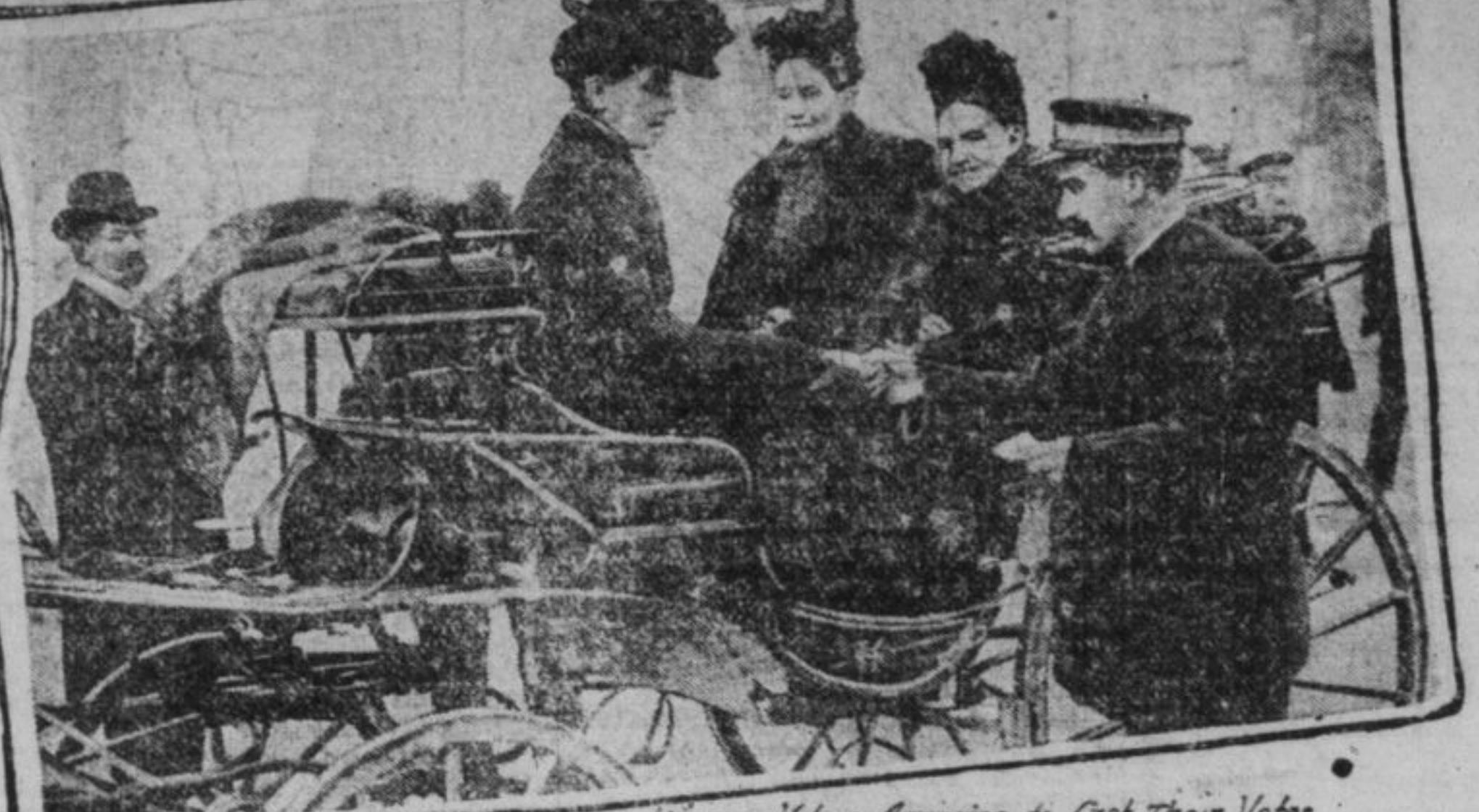
Women Voters Arriving to Cast Their Votes

PLAN SECOND CANAL Colombia May Parallel United States Cut Across Panama. Washington, Dec. 9.—The government of Colombia is contemplating the construction of a canal across the Isthmus of Panama, paralleling that of the United States, but at another point on the isthmus, and within Colombian territory. British capitalists are investigating the matter with reference to financing the enterprise. This is the startling news which has leaked out since the house appropriations committee returned from its visit to the isthmus. It is reported that the Rothschilds may finance the undertaking. Colombian officials are authority for the statement, alleging that the route for the completing canal has already been selected.