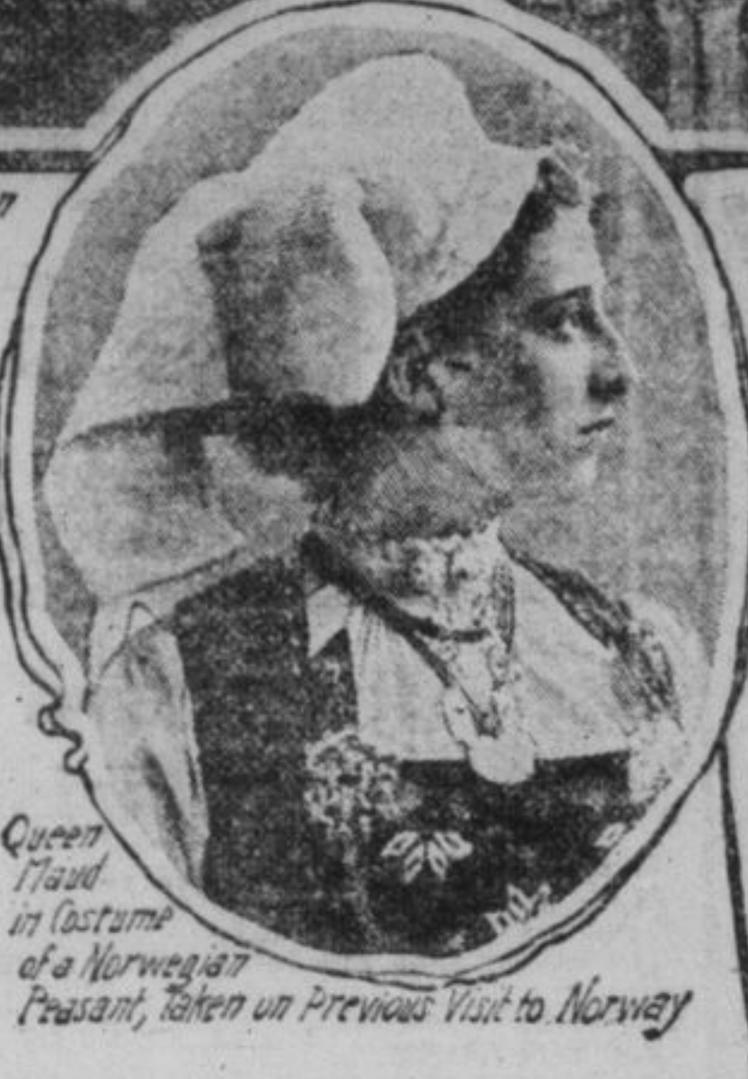
Queen Haakon in Costume of a Norwegian Princess, Taken on Previous Visit to Norway