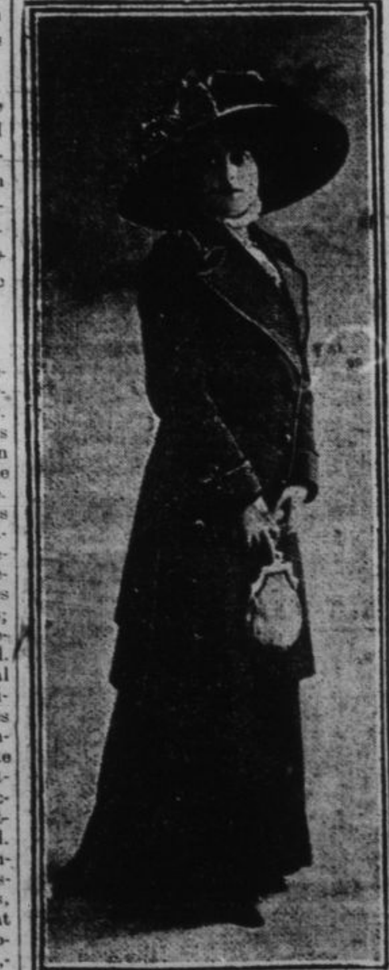
Dark blue street costume with fancy silk revere.

Hon. W. J. Hanna announces that the standardizing of hotels is nearly completed, and that in future hotels must keep up to the standard.