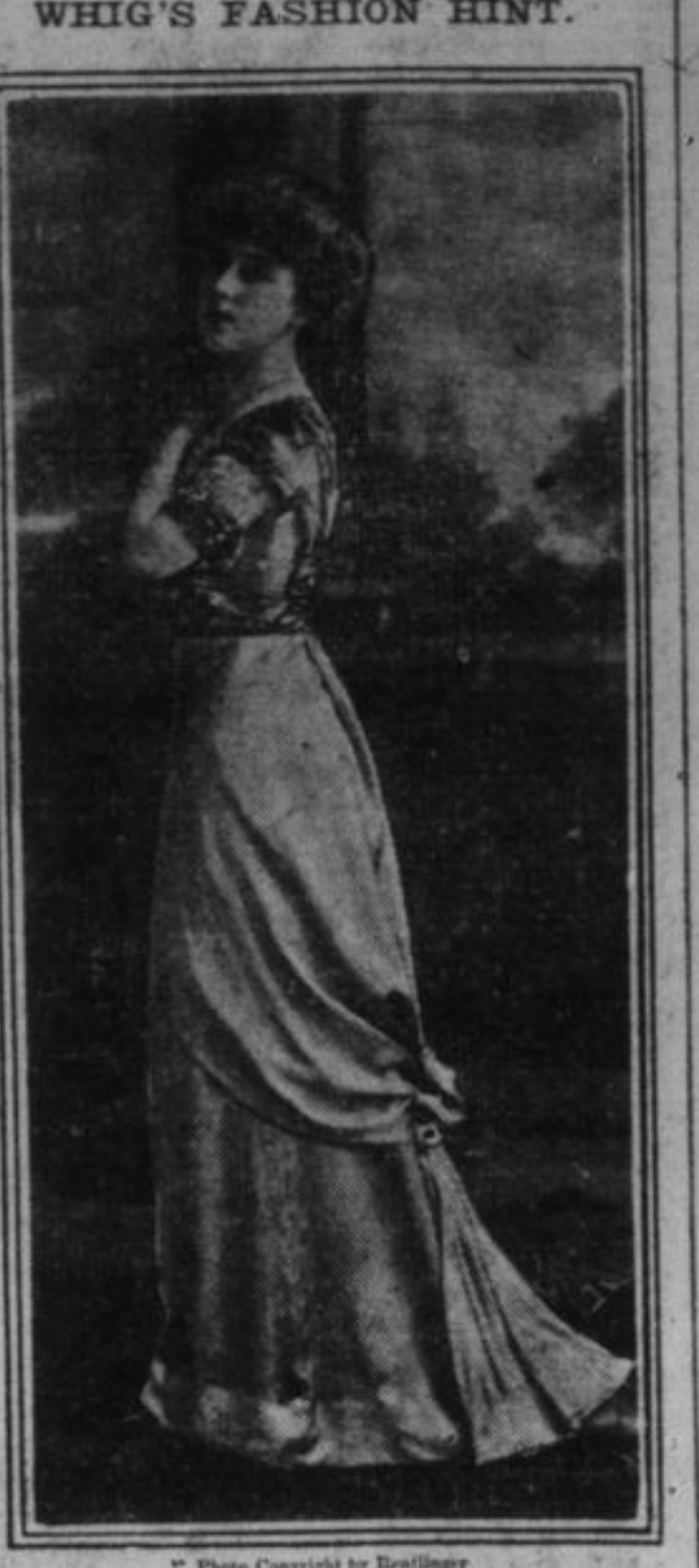
Tique blue silk cashmere gown with jet embroidered black chiton trim.