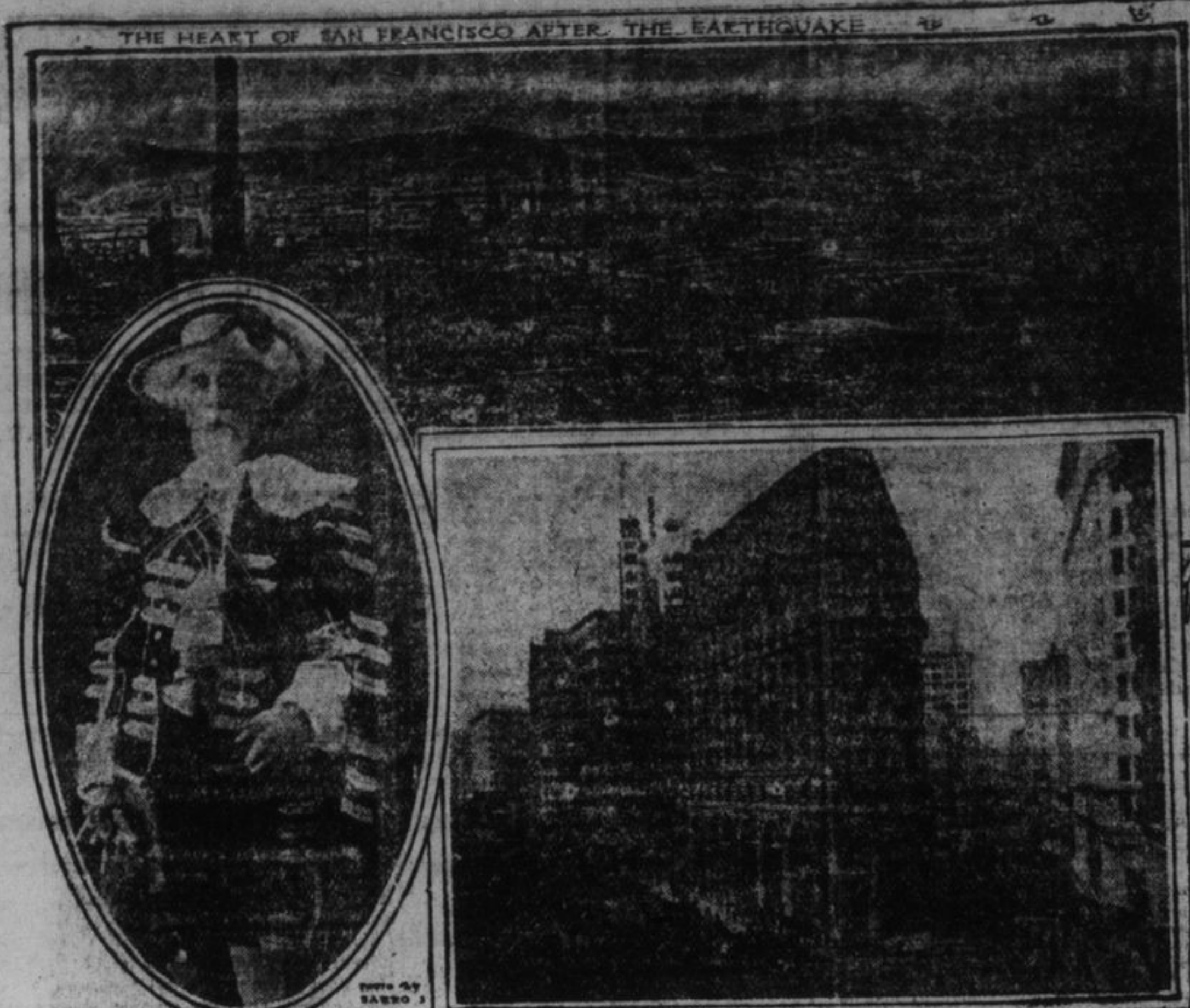
A VIEW OF RECONSTRUCTED SAN FRANCISCO

What a blessed world this would be if all our good intentions were carried into effect.